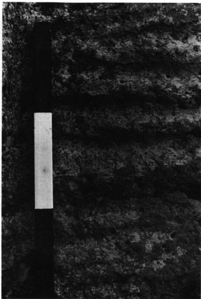
FIGURE 3. Close up of the tool marks in the left hand corner. The scale is in 100 mm units.