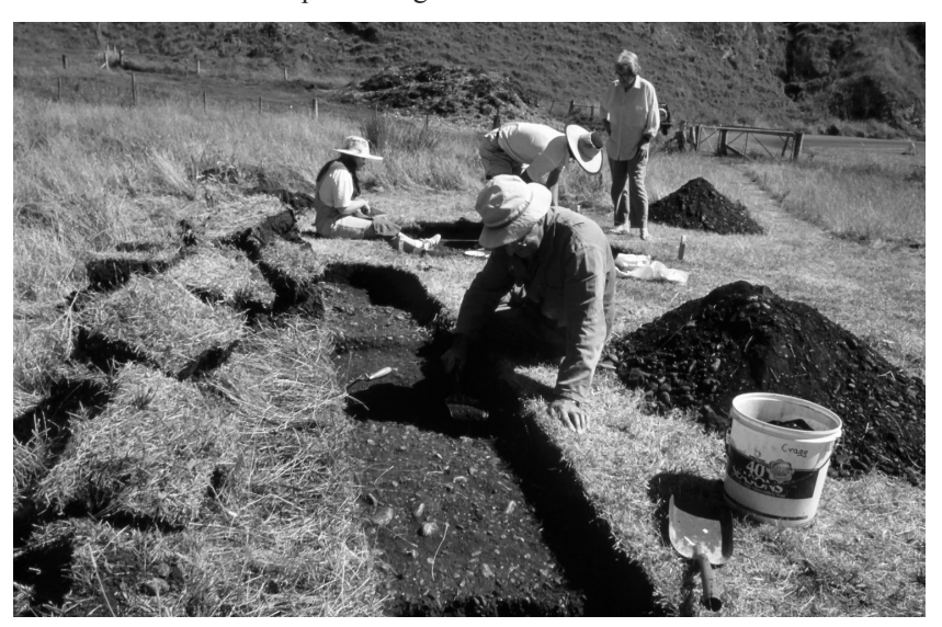
Figure 3. Excavating part squares L5-L6.

In 1993 a 2 m grid system had been used to facilitate recording of archaeological evidence relating to the historic woolshed. The same grid was used in 1994 and three 2 m squares (designated M1, M7 and N3), plus two part squares that formed a 'trench' (L5, L6 – Figure 3), were laid out and excavated; these are marked on the plan in Figure 2.