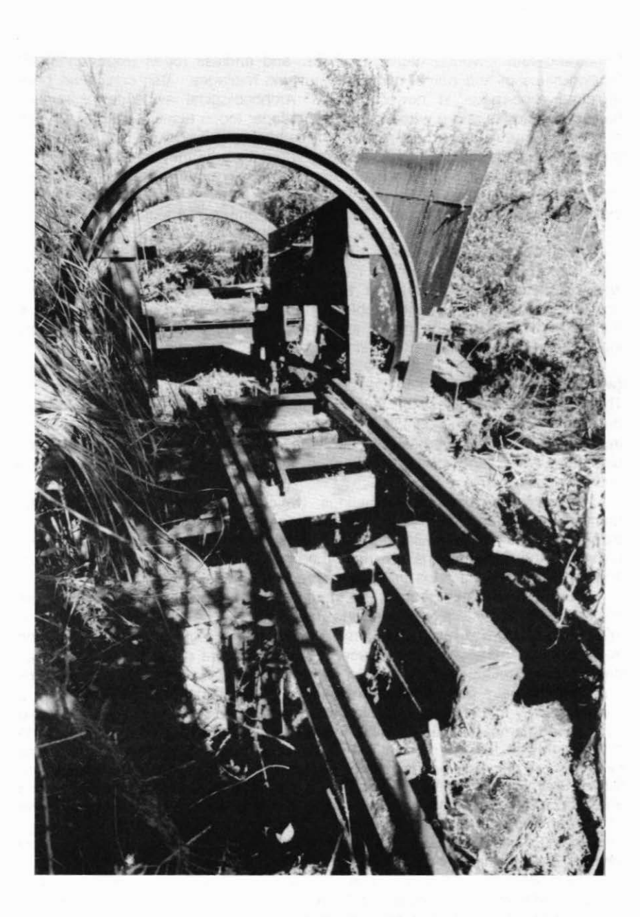
Plate 3. Renown mine rope-road tippler, Rotowaro (S14/152).