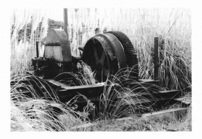
Plate 2. Winding gear and motor, Rotowaro No. 1 mine (S14/149).