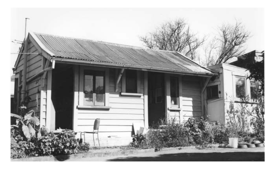
Figure 15. The shack behind the Anthropology Department at 5 Symonds Street in the 1960s.

and South Island fraternities that became more apparent with the creation of Auckland University's undergraduate course in prehistory, coupled with Golson's organisation of the New Zealand Archaeological Association.