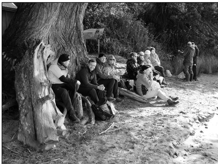
Lunch at Ulva Island.