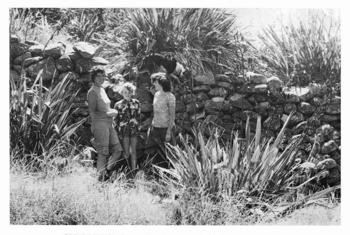
GREAT BARRIER. Stone wall on the eastern end of the Matawhawhau Point.