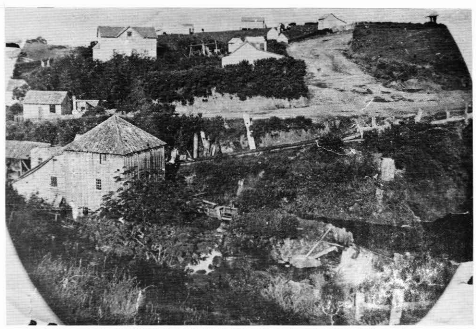
NEW PLYMOUTH FLOUR MILLS Plate 1. The Alpha Mill.