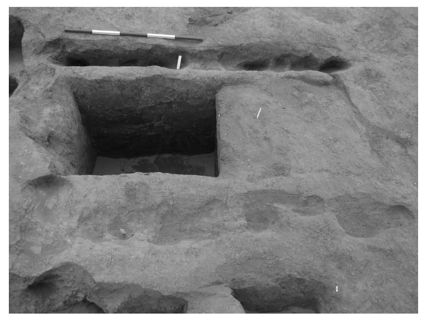
Figure 4. Pit in Area C with rafter slots along the edge. The pit has been halfsectioned but the outline of the full pit can be seen.

Several storage pits were present on the slope between Area C and Terrace 3. These pits were notable for the shallow angled postholes along their edges indicating where the roof rafters had been buried into the slope (Figure 4). Unusually for the Omokoroa area, one of the pits had clearly been left open for some time once it was disused: successive thin lenses of fill had washed in around one of the central posts. When the pit was about half filled the post was pulled out or had rotted away. At that point the pit was deliberately filled, possibly with material dug out of the adjacent uphill pit.