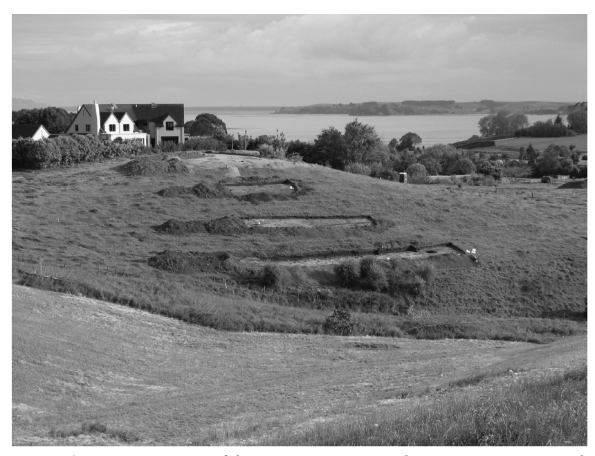
Figure 1. Panoramic view of the investigation area showing areas excavated. U14/3283 Area A is at the top of the slope (left), with Terraces 1-3 descending the slope. Area C is adjacent to Terrace 3, and Area B is the area the upper centre of the photo. U14/3284 is on the escarpment slope to the right.

same alignment and several had a 'step/shelf' at each end close to the ground surface and a board slot on the upper edge of the 'step'. The westernmost and flattest portion of Area A was surprisingly devoid of features and had possibly been disturbed or truncated although the stratigraphy did not indicate this was so. It could be that some levelling had taken place here in association with the adjacent house, reputed to be the remodelled early 20th century farmhouse. Only a few modern postholes were found across the area.