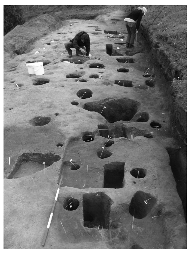
Figure 3. Photo looking along southern half of Terrace 3 from north to south prior to excavation of the rear 1 m of the terrace. The edge of the large pit with rafter slots is visible in the lower right of the photo.

scarp, or a natural slump scarp which had been modified. In some places there were up to seven superimposed activities including rua, rectangular storage pits (intercutting), firescoops and postholes. Interestingly, the area of intense activity came to a relatively abrupt end on the northeast side, though nothing in the topography indicated why activity should have been restricted. Analysis of the postholes according to fill type and colour (and implied phases of occupation) might provide evidence of a fence on the northern side.