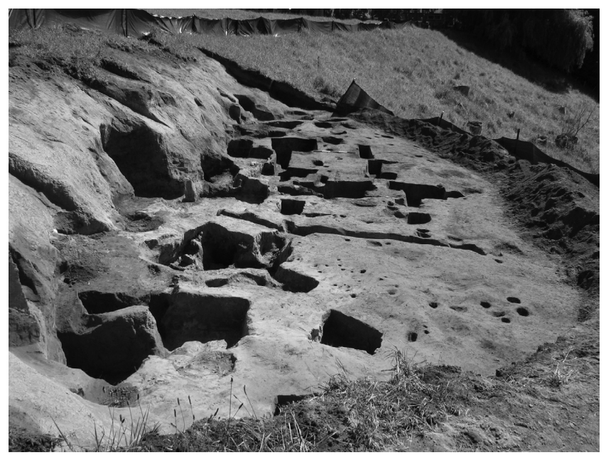
Figure 5. U14/3284 showing backscarp and terrace excavation.

This terrace was on the escarpment slope to the east of, and below, Area B. A digger was used to excavate the terrace and backscarp, exposing the midden which had been found by probing. Again, it is likely that the terrace and backscarp were a natural feature modified and used on several occasions (Figure 5). Similar features were discovered here as on Terrace 3, U14/3283, although not in the same density. Again, rua were dug into the backscarp of the terrace and there was evidence of successive occupations, although the rua appear to have been the first. Features were dug into or covered by the mixed midden and dark soil layer that overlay parts of this terrace and resulted from cooking activity on the terrace.