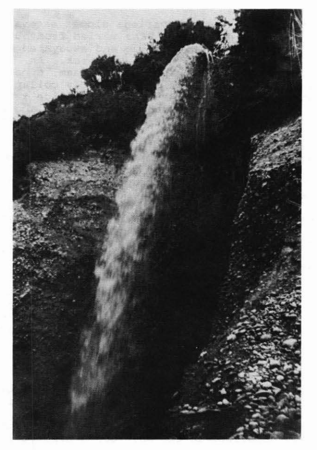
Figure 2. Ground sluicing on the western face of Sulky Gully in 1937. This method of extracting gold from alluvium involved passing a stream of water over the face of a terrace to assist with the mobilisation of gravels by pick, bar and rake. It is a laborious, but simple and inexpensive way of putting increased amounts of material through a sluice-box.

All earth, stones and any other waste material as well as the gold was carried by its own gravitation, with the aid of water from a stream, pipe, or bucket to the upper mouth of a tail race incorporating sluice boxes. Gold, being of higher specific gravity, and therefore heavier, sank and was caught in riffles and matting at the bottom of the tail races. When sufficient material had accumulated in the bottom of the boxing the gold was carefully separated by panning.