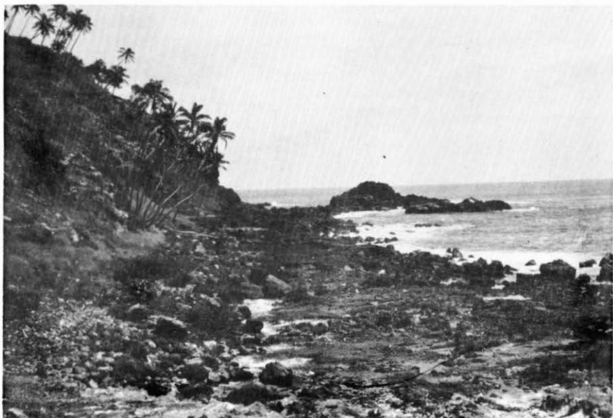
The Beach at 'Cabin.'