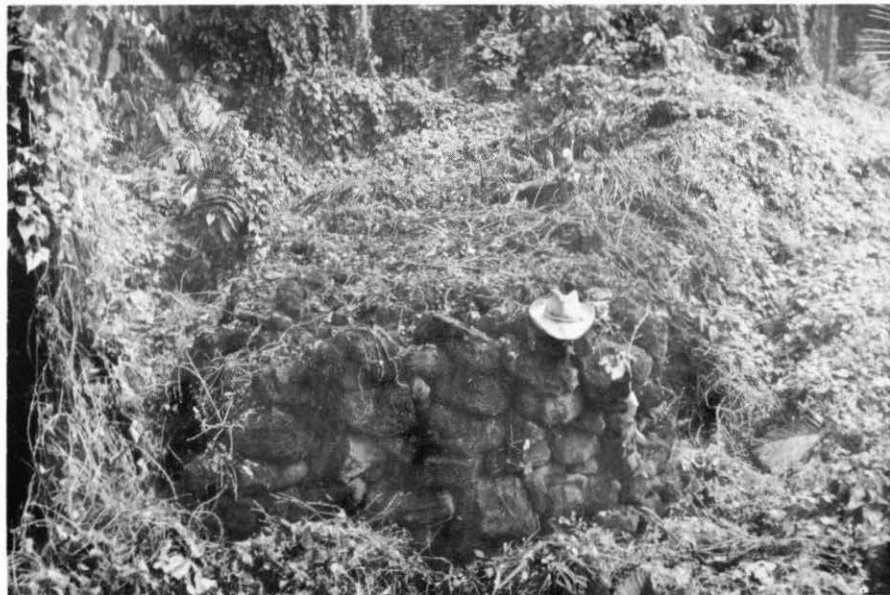
Entrance way through Pa Tonga at Mulifanu, Ofo Manu.