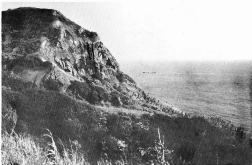
General view on north side.