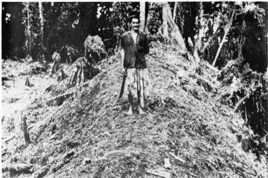
SU-Lu II Fort. Looking west along inner wall.