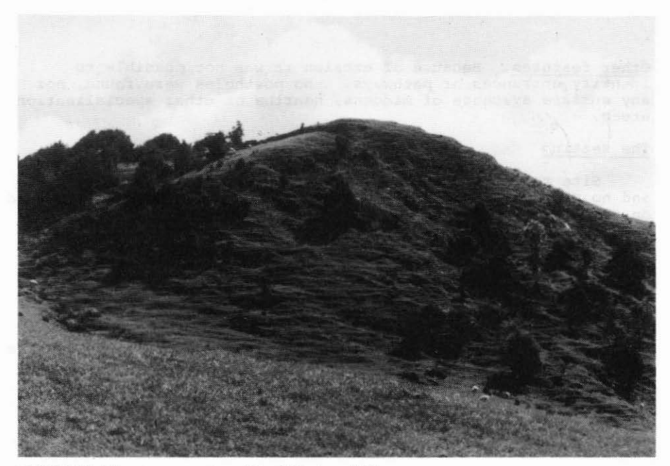
FIGURE 2. The steep eastern side of Bartons Hill.