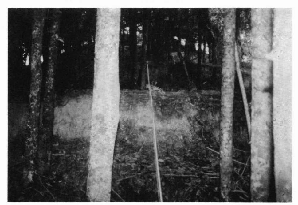
FIGURE 3. View north-east up spur with pits.