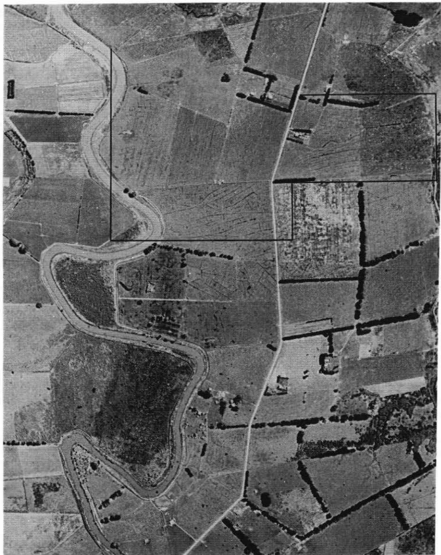
Figure 2. Aerial photograph of ditch system site-complex N7/277, mouth of the Awanui River. S.N. 350 1361/12, 12 October 1950. Awanui River and Kumi Road are dominant landscape features on the photograph and convenient reference points. Area demarcated is shown in detail at Figure 3.