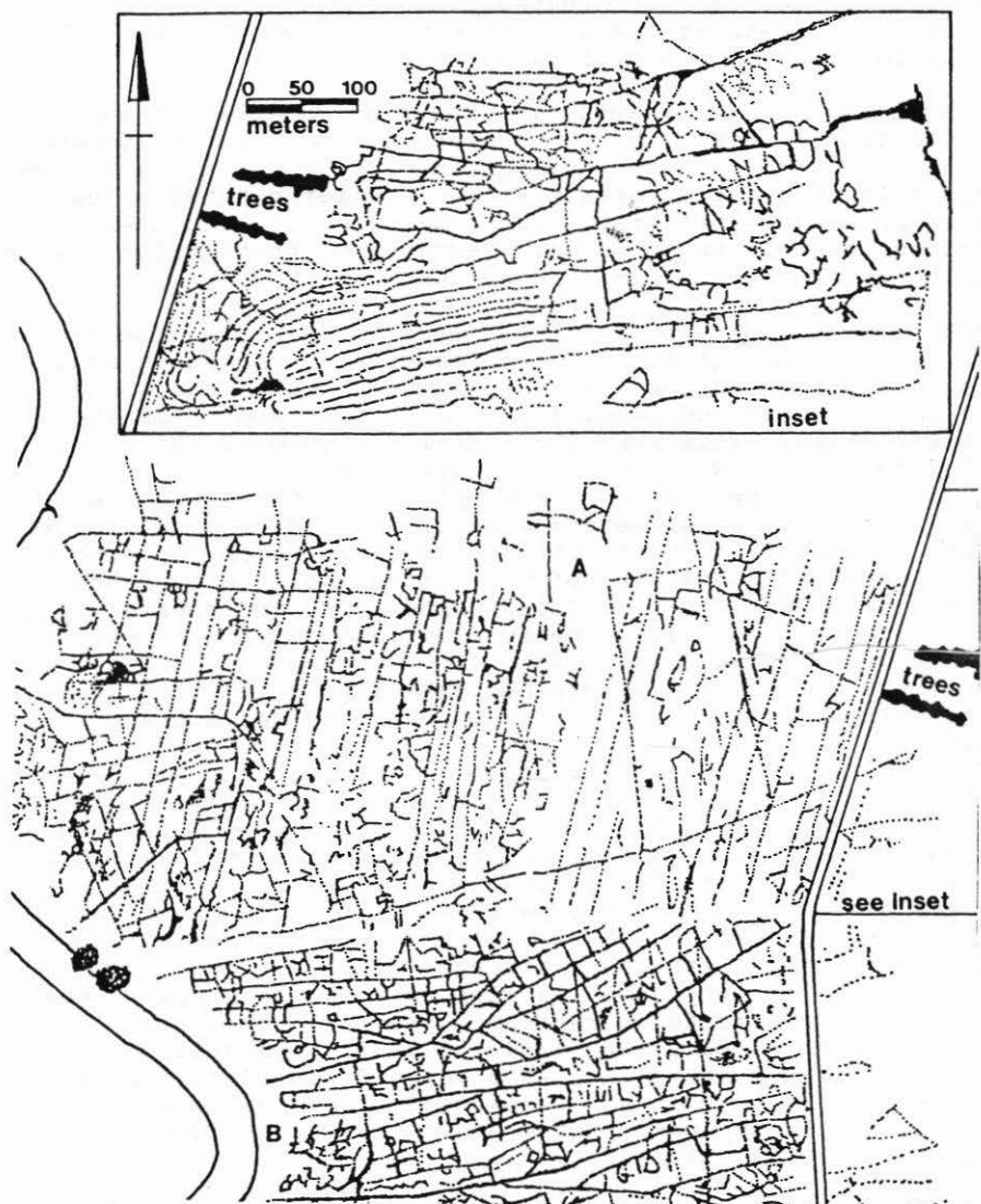
Figure 3. Ditch systems and plough remnants from a section of N7/277, as traced from a photographic enlargement of S.N. 350 1362/12 shown as Figure 2. Aside from reference points (Kumi Road and trees) other evidence of landscape modification has been deleted to facilitate clarity. North direction and scale as shown at inset also applies to the entire plan.