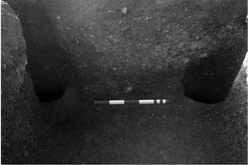
Figure 4. The large, round postholes in the northern end of the pit showing the raised collars of rammed earth around their bases and the gravelly natural stratigraphy visible in the end wall.