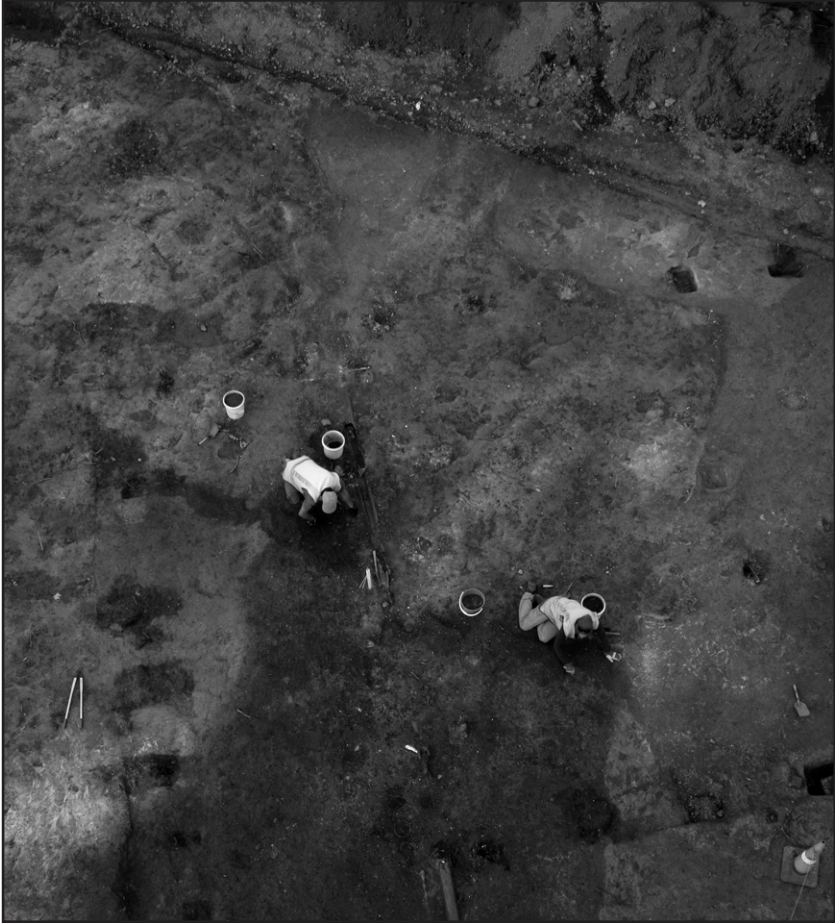
Figure 1. Plan of contact period Maori features at Pipitea St. The foundations, external drains and well of Smith's house are shaded grey. The lot boundaries are also shown.

addition to the west measuring 8.3 x 3 m with smaller postholes; the third an 7.2 x 4 m addition to the south with a brick foundation. Beneath these three phases were three features that were unlike any others on site. While most of the historic features, with the exception of boundary fences, were oriented on the road, these features were oriented on the sea cliff. One was a darker soil measuring 11.5 x 4.5 m; another a pit measuring 6500 x 1400 mm and 700 mm deep; while the third was a row of five postholes running at right angles to the sea cliff, the only set of features to do so (Figure 1).