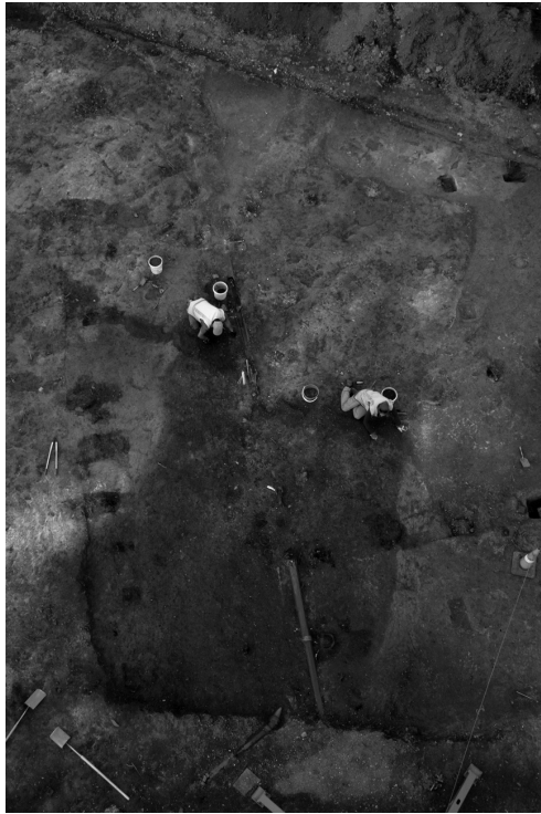
Figure 2. The Feature 15 soil during excavation with the foundations and drains of John Smith's house visible cutting it.

The soil, Feature 15, was aligned north west–south east at right angles to the sea cliff and, where it was excavated, up to 220 mm deep into the clay subsoil. It was a well dug topsoil, standing out as a darker grey yellow against the brown yellow natural soils (Figure 2), incorporating gravels that seemed to be imported, that is they were not the angular chunky gravel that underlay the clay layer. A 1 x 1 m sample square was excavated which showed that the feature was shallow and its sides sloped gently down to its base. The gravel was not evenly spread through the soil but distributed in lenses consistent with being dug in. Soil samples were taken from across the feature for microfossil analysis. Samples were also taken for particle size analysis to determine the nature of the added gravels from both within the feature and the natural matrix adjacent to it.