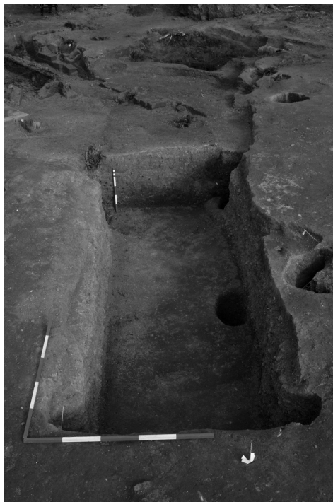
Figure 3. The pit after excavation showing the fill profile.

The pit, Feature 77 was located 2.6 m to the south west of, and aligned at right angles to, the soil. The northern 3800 mm of the pit was excavated (Figure 3). The fill of the pit was a chunky mottled yellow brown soil that became increasingly dark towards the base. A soil sample was taken from the base for microfossil analysis. This pit had heavy round postholes rebated into the walls. They were generally 280 mm in diameter, situated at each corner and halfway along each side. The fill at the base of each had been rammed forming a raised collar around the top of each posthole (Figure 4).