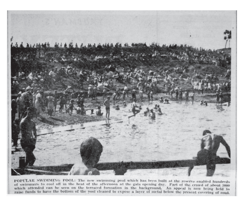
Figure 4 : Some of the estimated 3,000 people who participated in the gala event marking the re-development of the Turuturu-mokai reserve on 5 March 1955. Newspaper photograph taken from The Hawera Star 9 March 1955.

At the request of the Hawera Borough Council, Houston wrote a pamphlet entitled Turuturu-mokai Historic Reserve near Hawera an historic survey , which was published in 1958. It was divided into three sections: The Old Maori Fortress; The Pakeha Redoubt; and The Carved Post of Goodwill. The work brought together articles Houston had written in the 1930s and published in The Hawera Star . This pamphlet remains the standard history of Turuturu-mokai.