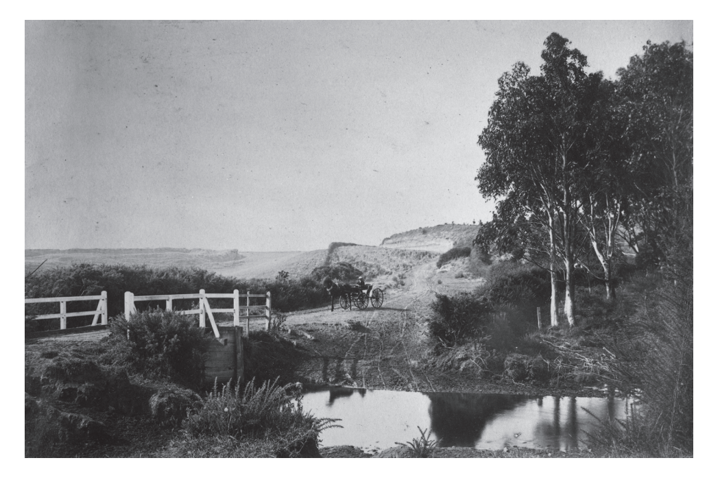
Figure 2 : The earliest known photograph of Turuturu-mokai pa (centre left) taken probably in the early 1890s.