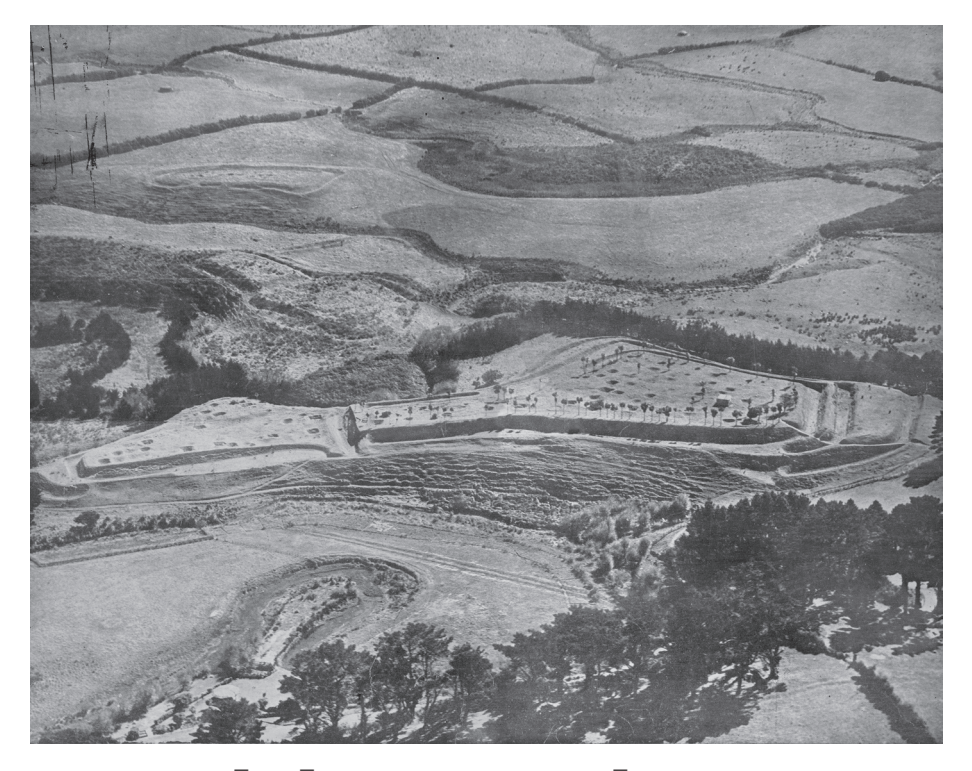
Figure 1 : Turuturu-mokai pa (centre) with two satellite pa (now destroyed) upper left. This aerial photograph probably dates from the late 1940s.

mentioned in S. Percy Smith's History and Traditions of the Maoris of the West Coast (1910). This is somewhat curious, given both its spectacular size and associated history.