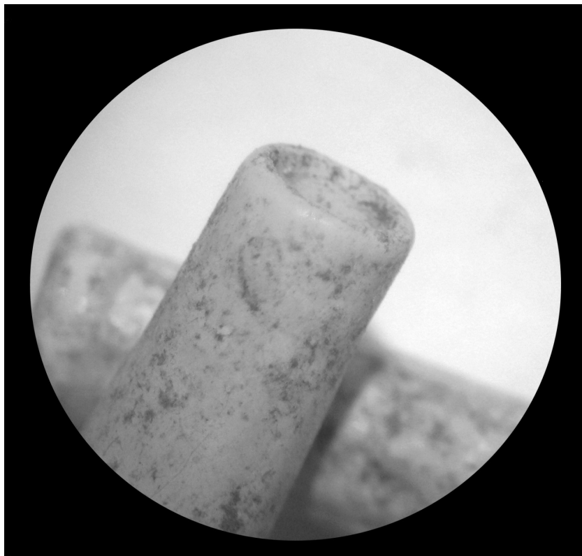
Figure 2. Photomicrograph showing the rounded end of a unit.

Multiple strand ornamentation – necklaces, bracelets or anklets – does not seem to be recorded for Māori, but multiple loops of shell necklaces are currently common on some Polynesian islands. Similar fashions may well have occurred here in the past.