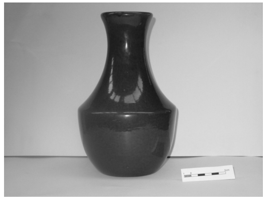
Figure 7. Vase dating to Period Four. Private collections.

round/rotund bodies to large spill vases and this indicates the possible range available throughout Benhar's production history (Figure 7). The glazes in the 1970s were duller and more opaque than earlier glazes (Henry 1999, Hurren 2004, Lambert 1985).