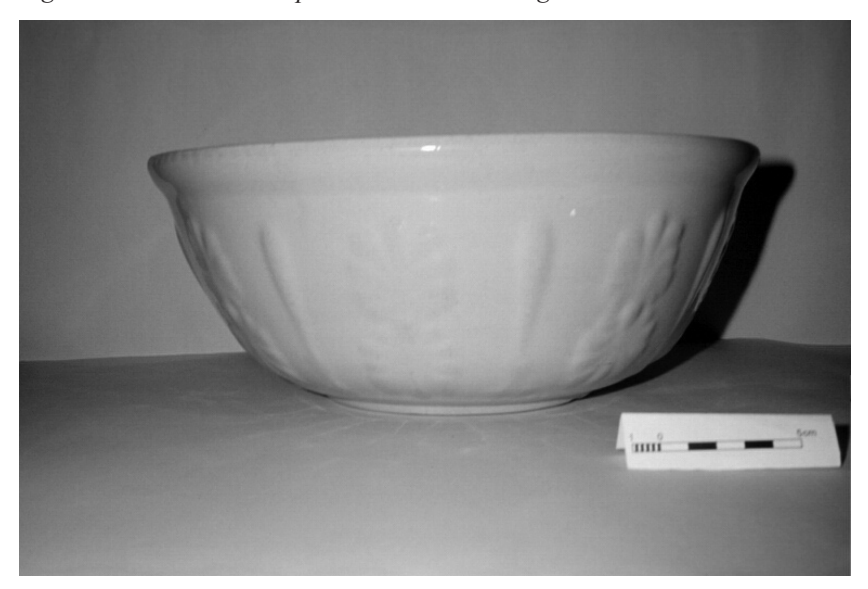
Figure 5. Large mixing bowl. South Otago Museum.

Products from this period consisted of quite thinly glazed stoneware items in simple shapes. Other items produced during the 1920s consisted of