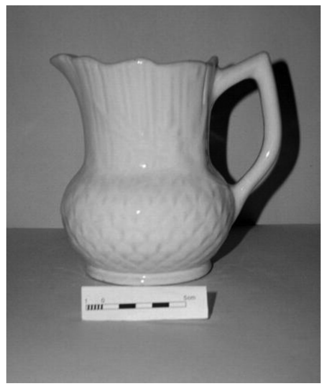
Figure 6. Thistle jug from the 1930s. South Otago Museum.

Wares were produced and labelled under the mark of Crofter wares with a large proportion being sent to Australia and some being sold directly from the Benhar factory (Lambert 1985). The wares were again utilitarian and some bore the mark of "CROFTER WARE, MADE IN, NEW ZEALAND" on them or simply "CROFTER WARE". A large range of items were produced in this period including salt and spice dispensers, jars of a range of styles, hanging pot plant holders and dish shaped pot plant holders and vases of a range of styles. Barrel crocks and creamers were remade without the lug handles and used for pickling. Some items made in the 1970s had ribbing on the body that can be seen on the jars, salt and spice dispensers and smaller sized vases. There was a range of glazes in this period, with the majority in the brown and green ranges. The items that were made in colour used very thick dense pastel glazes or slips. A wider range of vases appeared, ranging from small vases with tall necks and