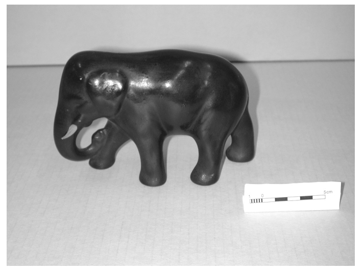
Figure 3. Benhar elephant from Period One. Private collection.