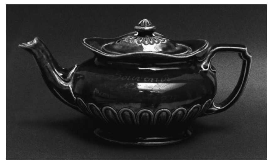
Figure 4. Benhar blue teapot dated to 1926. Otago Museum.