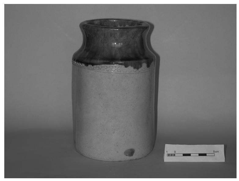
Figure 2. Benhar jar from Period One. Private collection.

in the late 1920s. Items that continued to be produced after the late 1920s were funeral urns and spill vases (Henry 1999, Lambert 1985).