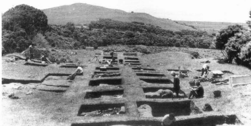
Figure 2. General view of excavation to the east.

than others. Layer 2 was also divided into three or four sub-layers consisting of varieties of midden and fill. Mixed within these fill layers were shell lenses and clay lumps. Some squares had a thin grey ash layer beneath the fill layers (Layer 2d). Layer 3 was a firm yellow sandstone bedrock into which the original storage pits had been dug.