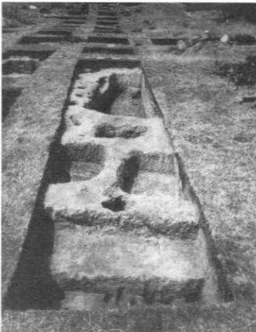
Figure 3a. Pit and bin complex as seen from the NE.

This group of pits (Figs. 3a and 3b) was located in the NW area of the site. The grouping consisted of a very large pit, two large pits and three shallow bins. Three bins were located at the east end of the largest pit. The bins were shallow and ranged in size from 50 cm square to approximately one metre square. The formation of 123 postholes at this level around the pits suggested pit roofs, palisade rows and one house floor consisting of 19 postholes, both in separate areas of the site.