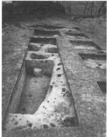
Figure 3b. Pit and bin complex as seen from the SW.