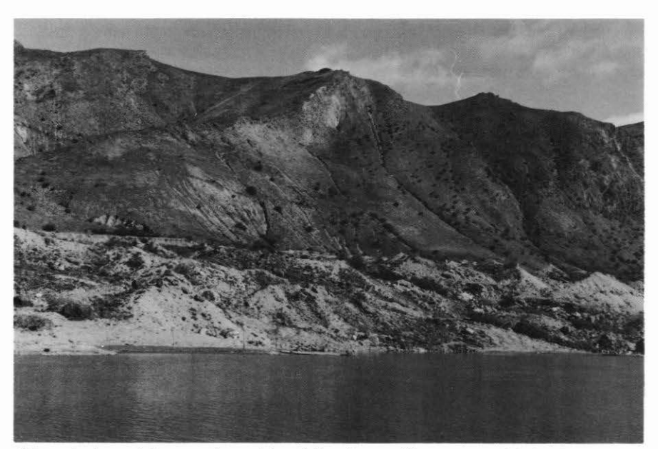
General view of the western side of the Bannockburn arm of Lake Dunstan.

above the river bed. These were extensively sluiced from the 1860s. In the Cromwell gorge, the tailing areas have been completely flooded. From about 1 km below Cromwell to the upper end of the Bannockburn flats, the low terrace tailings are partly emergent at the lake operating level. Any tailings with slopes greater than about 25° have suffered slumping, with particularly noticeable loss of small points where tailings lines have been washed away. The characteristic profile is a surface of large rounded boulders with a steep scarp of gravels up to 3 m high down to the water. The slow filling of the lake and the water saturation of gravels means that probably all such tailings have collapsed in the course of filling. In the area just down stream of Cromwell, in the upper part of the gorge, the water level lies just on the top of the gently sloping terrace. Here tailings have stayed reasonably stable and can be viewed quite readily from a boat.