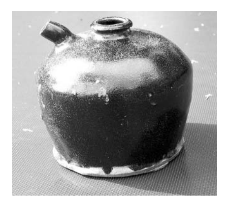
Figure 1. Soy sauce pot.

Three items are brown glazed stoneware containers called 'Jian You.' Such vessels were made in one piece on hand wheels by numerous independent potters in China, The one complete (though cracked) item in the present collection is a soy sauce pot, although they were also used to store other liquids such as black vinegar and black molasses (Figure 1).