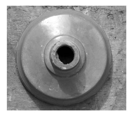
Figure 3. Opium pipe.

Cleave's Street Directory also lists a number of other Chinese occupiers along Wakefield Street between Queen Street and Abercrombie Street (later St Pauls