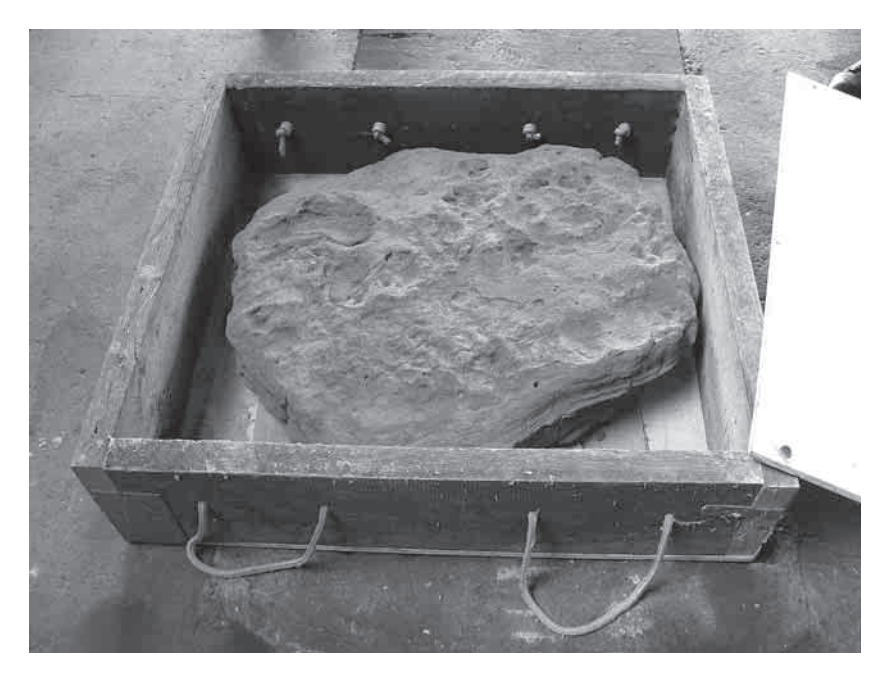
Sunde site ash block to be displayed in Auckland Museum.

remain on the island, but more recent consultation has resulted in agreement that presentation of the block in the museum would make it more accessible to the wider public.