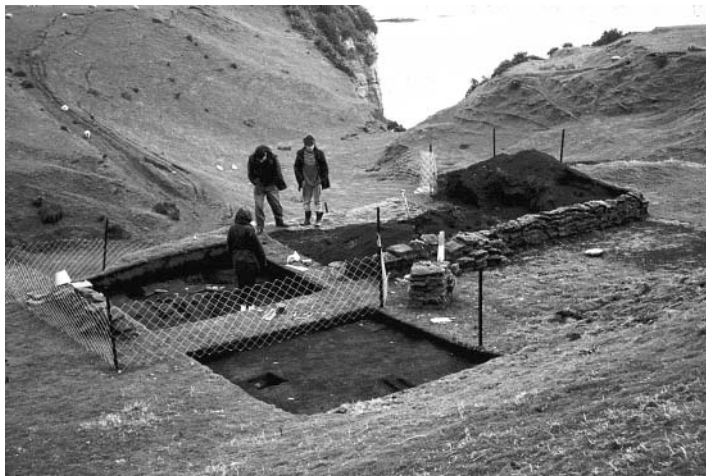
Figure 24. Puearuhe, 1969.