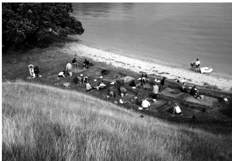
Figure 27. Galatea Bay, Ponui Island, excavation in progress, Easter 1965.