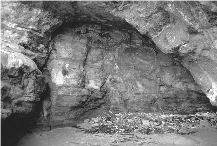
Figure 2. Contemporary photograph of the Sandy Bay rock shelter. The cave extends to the right of the picture and Figure 3 (below) is taken within the cave and at right angles to this photo.

The earliest clearly identifiable references to the Sandy Bay rock shelter are in the form of artefact accession records held at Auckland Museum. These records (Reg. nos. 25414.1-2; 25415), date from 1940. They indicate that four broken, and one partially manufactured, shell fish hook points were recovered from the site by Messrs [G.] Archey, [A. T.] Pycroft, [A. W. D.] Powell and [V. F.] Fisher, presumably on a sponsored field trip. The points, made of Cookia shell, were recorded as having been found at a depth of 6 feet (1.83 m). Vic Fisher