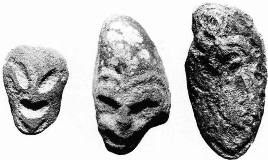
TARANAKI STONE SCULPTURES Plate 1. Papaka sculptures.