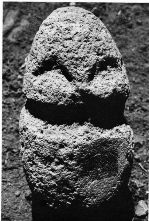
TARANAKI STONE SCULPTURES Plate 2. Tarakihi sculpture.