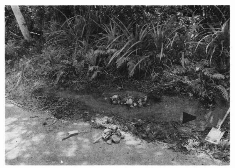
Plate 1. South facing roadside near Stratford Mountain House revealing a 3.5 m long sub-horizontal occupation site consisting of an umu, a charcoal layer spread on either side and a nearby pit (indicated by arrow).