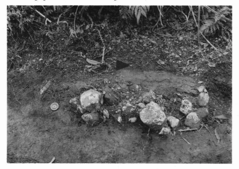
Plate 2. The umu immediately underlying two continuous and prominent tephra beds. The upper tephra bed (indicated by arrow), the Burrell lapilli and the lower bed, the Burrell Ash.

Plate 1. South facing roadside near Stratford Mountain House revealing a 3.5 m long sub-horizontal occupation site consisting of an umu, a charcoal layer spread on either side and a nearby pit (indicated by arrow).