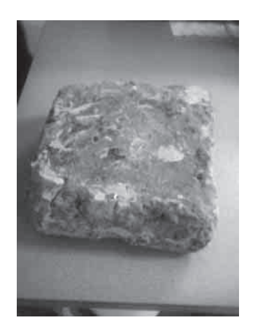
Figure 1. Photograph of an unfired brick from tunnel complex.

(which appear to be wet enough that some that have been recovered from the tunnels have reappeared as pottery (Swabey 2007), also see Figure 1), the entrances buried and the air shafts and other shafts in-filled. However, interest in the tunnels did not die there. Even into the 1960s there were newspaper articles excitedly proclaiming ideas and opinions about the future use of the tunnels (Auckland City Archives a-d). These were renewed in the 1990s by two separate groups, a businessman seeking to open it as a tourism venture, and a group of architecture students and their lecturer who viewed the tunnels as part of the solution to Auckland's traffic problem (Bourke a; Tonks 2007). However, not a lot is known about the tunnels at all (Bourke 2007; Farrant 2007; McBride 2007; McCann 2007; Mitchell 2007).