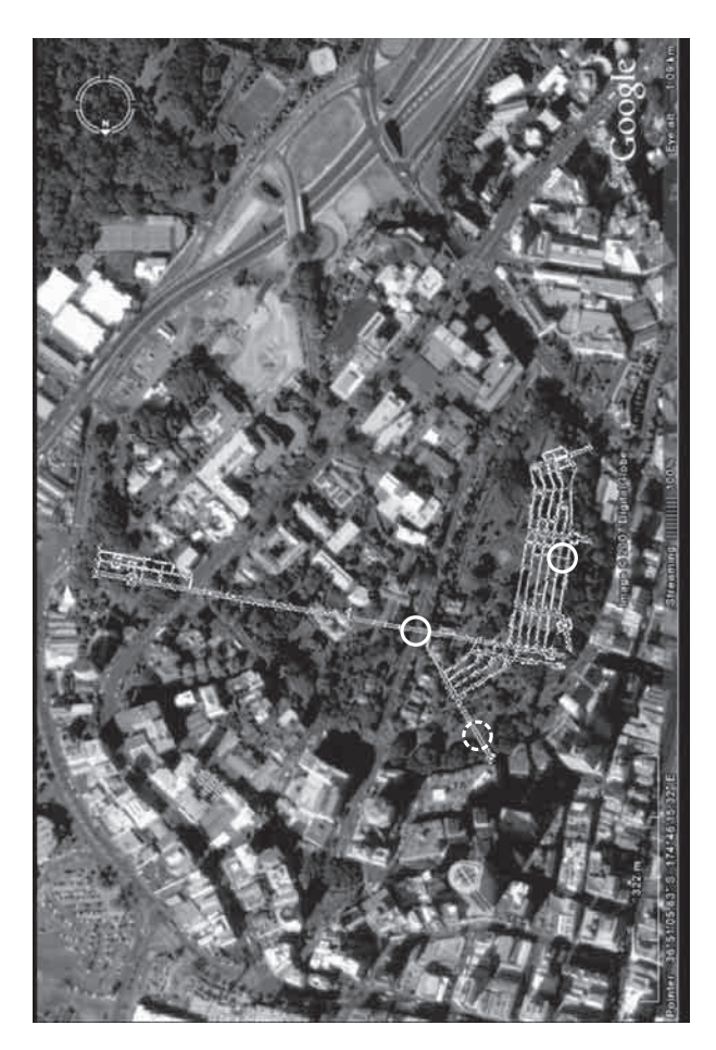
Figure 2. Composite image of tunnel systems, circles indicating known collapses, dashed circle indicating suspected collapse. Cityscape taken from Google Earth, tunnel layout taken from engineers blueprints (sourced from Auckland City Archives).

servation of the tunnels would need to be carried out during and following an investigation as an exploration would not be permitted to occur without the intervention of structural engineers, which is one of the reasons why to date nothing has occurred, as there appears to be no-one willing to finance a team of engineers – particularly on a project which could fail (Bennett 2007; Crossley 2007; Farrant 2007; Tonks 2007).