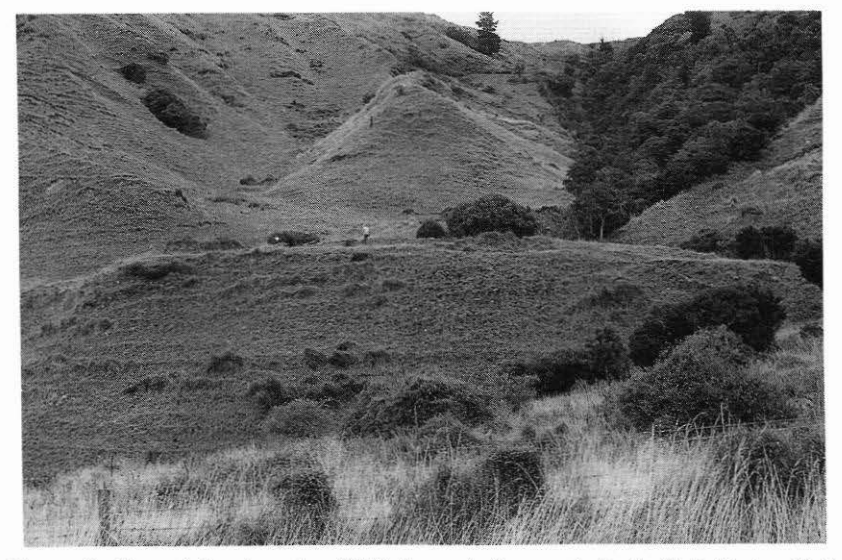
Figure 2. One of the sites that "fell through the cracks". Artificially levelled areas and pits occur on the terrace in the centre of the photograph and there are the truncated remnants of garden walls at its base, site P30/33. Photograph taken from State Highway 1, 1998.

and we came to the conclusion that the whole area needs to be resurveyed and some accurate mapping carried out – something we hope to do this forthcoming summer.