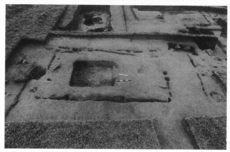
Figure 4. R11/899: slab and post house with porch and central firepit.