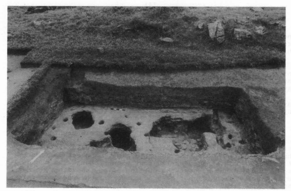
Figure 3. R11/899: large storage pit with intercutting floor pits.