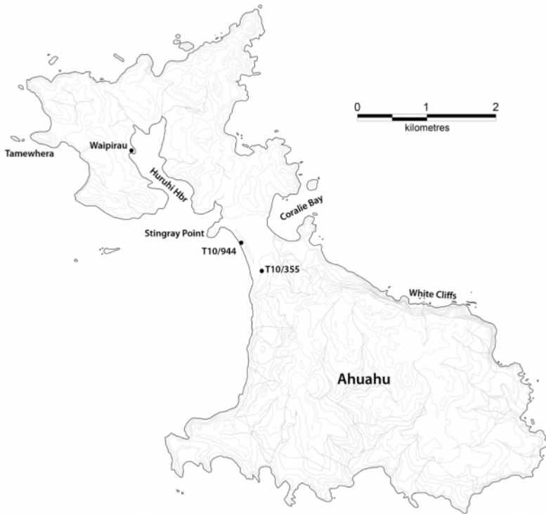
Figure 1. Ahuahu Great Mercury Island showing places referred to in the text.

and petrified wood. Some of the basalt may also be suitable for flaking, and has been used for ovenstones.