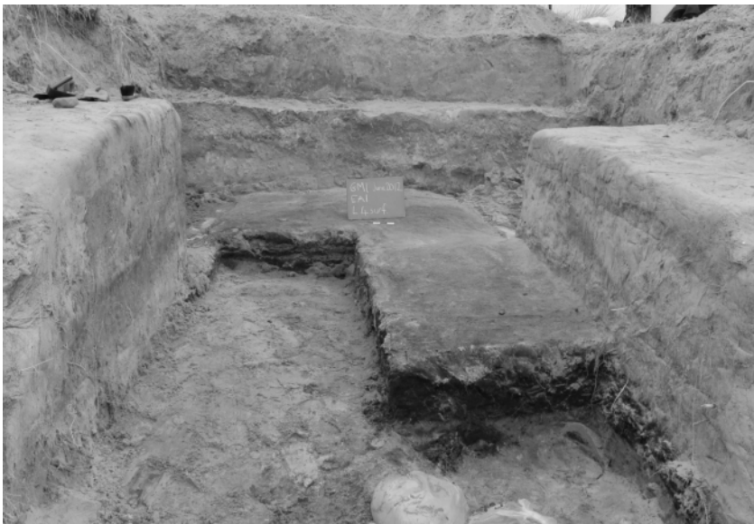
Figure 2. T10/944 (EA 1) excavation area

very few regional research studies carried out, notably the Wairarapa Project (Leach and Leach 1976), the Southern Hunters Project (Anderson 1982), the Chathams Island Project (Sutton 1980) and smaller projects such as the Pouerua Project in Northland (Sutton 1990, 1993; Sutton et al. 2003) and Motutapu Island (Davidson 1978). This project will have a wider focus than other regional studies and be of greater relevance than the southern projects for interpreting northern North Island archaeology. Most importantly however, large projects generate enthusiasm by new generations of archaeologists and it is anticipated that the data will be used by students at post-graduate level to develop new research ideas and theoretical approaches.