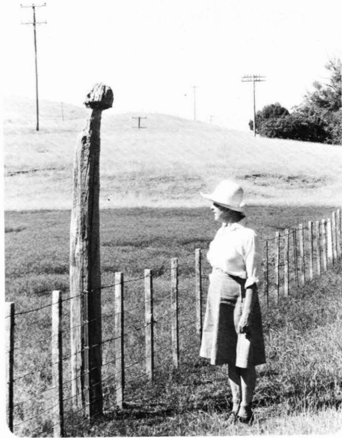
Fig.1: Aileen Fox at Taurekareka paa , Hawkes Bay 1979.