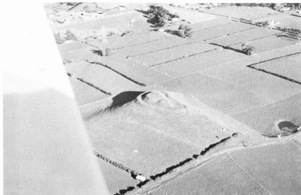
TE NGAHORO. Aerial view from the north.