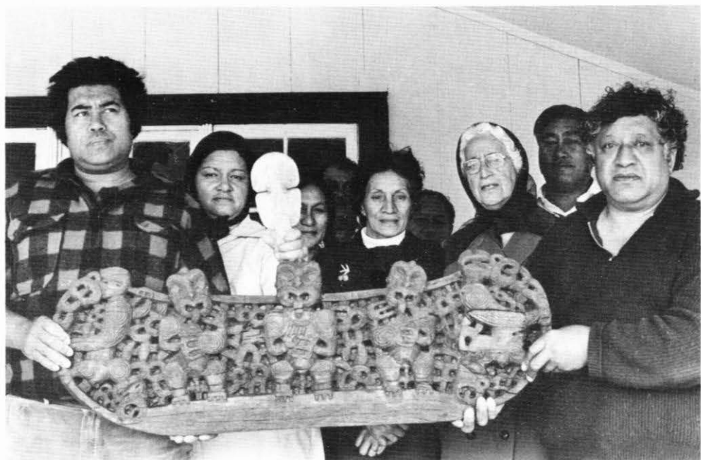
THAMES LINTEL. At Mataiwhetu marae .