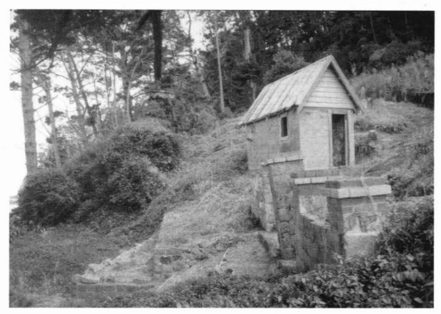
Figure 6. A north view of the Tararu Cemetery entrance in 2001: a turning area (left), steps, gate piers and shed.

Cemetery headed by Anna Selmes (whose husband was buried in the cemetery in 1924) carried on from the Ladies' Committee from the 1940s to the 1960s, after which the cemetery fell into neglect (Alistair Isdale, pers. comm. ). Poulgrain (1999) recalls: "The Garden of Sleep as she [Anna Selmes] called it, was kept like a park partly with her own labour and partly by assistants to whom she would pay wages out of her own pocket." When the site was recorded in 1995, herbicide was widely and effectively used by district council, and apart from some oleander, agapanthus, periwinkle and eleagnus, the cemetery was distinctly stark in appearance. Access from the Coast road has been closed for safety reasons since 1998 and no maintenance has been carried out in the cemetery (Montgomery Watson 2001: 52), and vegetation has taken hold again. Several clean-ups have been done since 1998 including one last year by members of the Elim Church youth group which volunteered several weekends clearing half the cemetery ( Hauraki Herald , 16 June 2000).