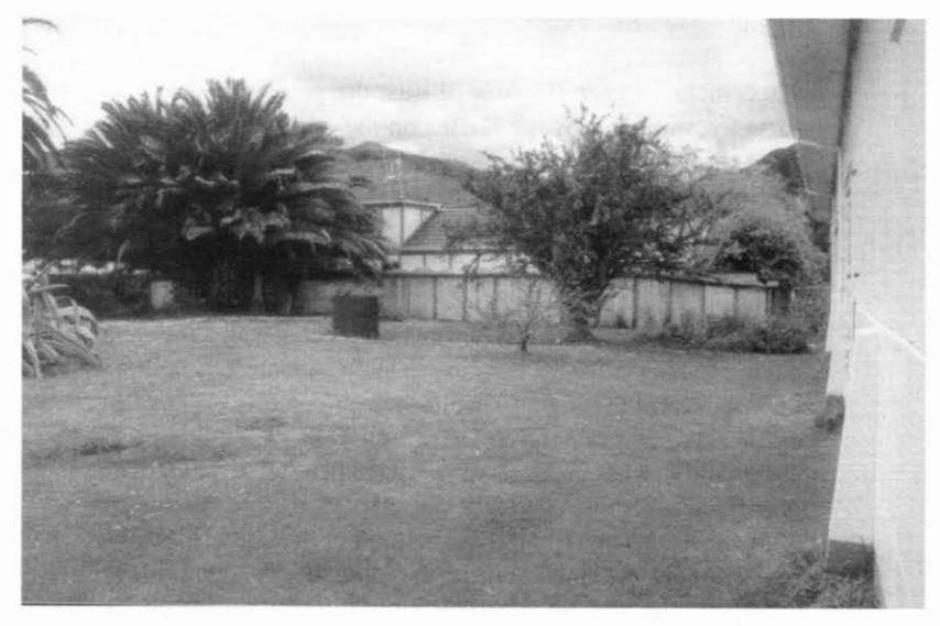
Figure 3. A northeast view of cemetery T12/899 in 2001. The Feel Great gymnasium is to the right. Surviving monuments are under the Phoenix palm to the left.

"There are three separate waahi tapu located at the site of the Te Kauaeranga Pa. The first burial site is located under and adjacent to the Thames fitness centre, Feel Great Ltd., and a couple of surrounding sections including two blocks of flats. This urupa was also used by the first European settlers to the area. A few headstones remain, dated 1868 and 1870."