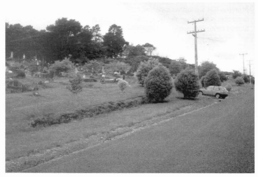
Figure 5. An uphill, southeast and partial view of Shortland Cemetery from Danby St. in 2001. The lower part is in the foreground and the upper, earlier part is under the tree camopy.

concrete to form grave boxes. Spaces among graves may either represent unmarked graves, unused plots or the lose of wooden 'headboards' to a fire which went though the cemetery at some stage (David Arbury, pers comm. ).