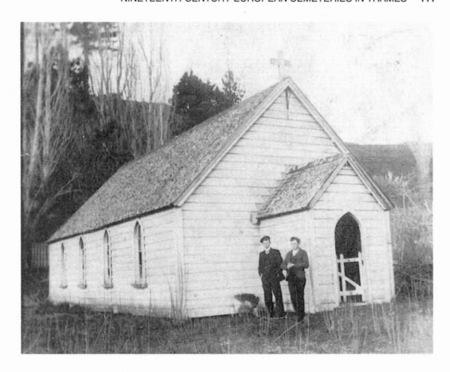
Figure 1. The Church Missionary Society church at Parawai, with a wooden picket grave surround visible near the left window.

Watsonia, periwinkle, leaf litter and tree trunks covered the ground, but now the privets have been cleared and the area has been converted into garden. The slope on which the headstones are located has been modified in recent years with the construction of a brick retaining-wall.