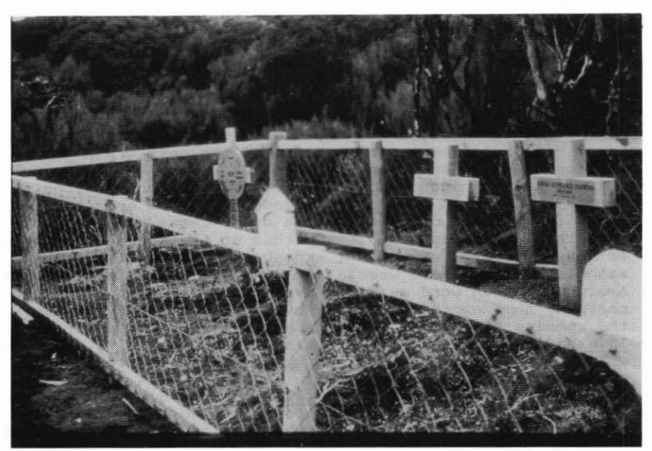
Figure 2. Cemetery at Hardwicke settlement site, Erebus Cove.