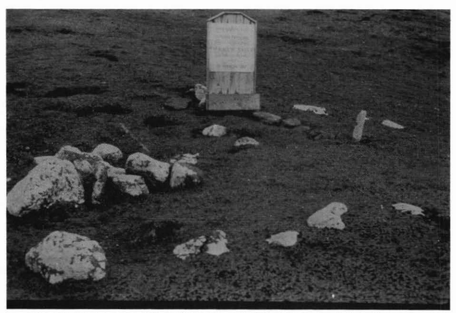
Figure 3. Mass grave of 15 victims of wreck of the "Derry Castle", Enderby Island.