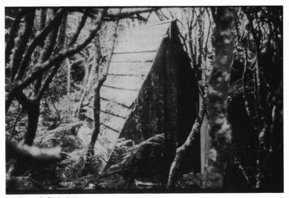
Figure 5. Stella hut.