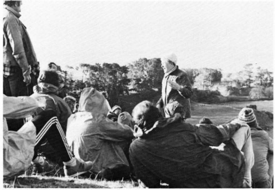
CONFERENCE FIELD TRIP. Aileen Fox at Tiromoana.