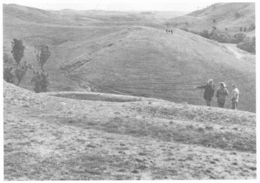
CONFERENCE FIELD TRIP. Raised rim pits at Waitio.