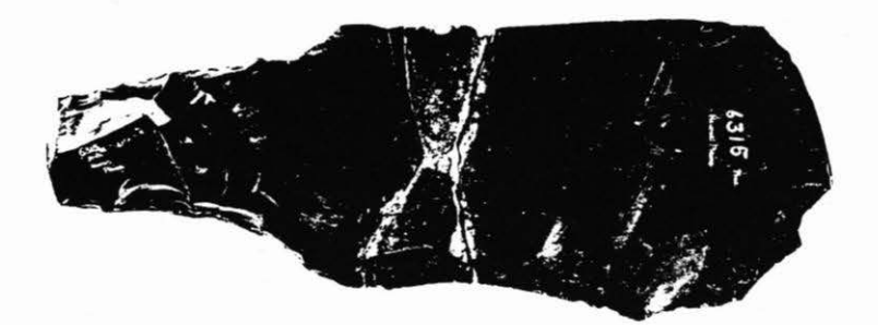
FIGURE 1. Obsidian 'patu' (6315).

The pendant (Fig. 2a; 48846) is part of the Mizzen Collection from Great Mercury Island (Ahuahu) off the east coast of the Coromandel Peninsula. It is similar in form to the greenstone adze-shaped ear pendant (kuru papa) but has two notches on either side for suspension. This pendant has been ground on all surfaces. The irregularity of shape at the upper end suggests the suspension on one side may have been modified after the initial notching was damaged, and the reworked surface