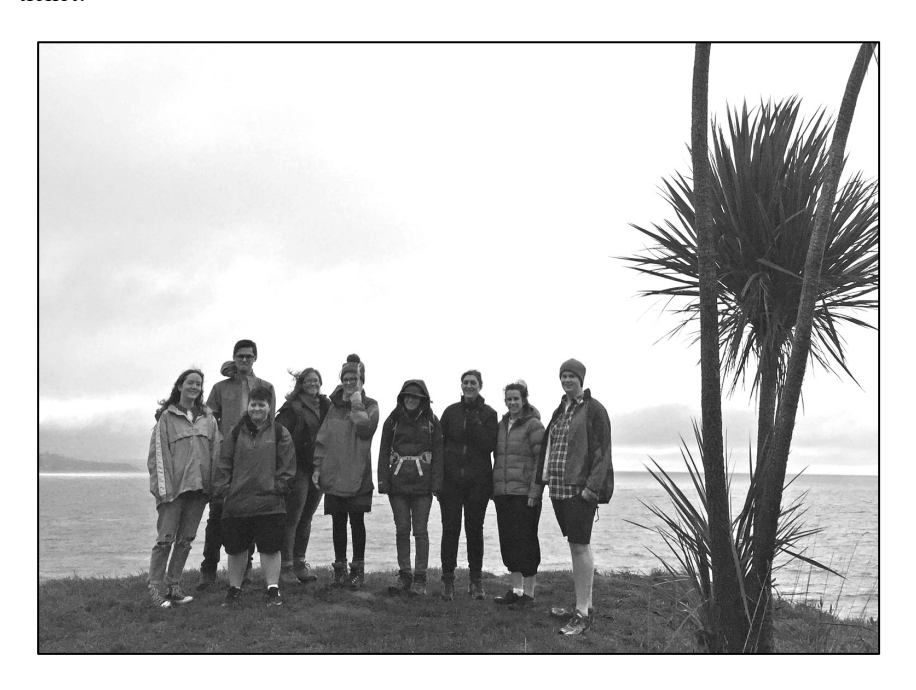
Figure 5. Auckland and Otago students at Mapoutahi pā site on the Otago coast. In August, a contingent of Auckland University Archaeological Society members came to visit. Students from both the Otago and Auckland societies headed out on a field trip to Lawrence Township, visiting Gabriel's Gully, as well as the historic Lawrence Cemetery, and the pub on the way home. The following day we headed north up the coast to Purakaunui, visiting the Mapoutahi pā site (Figure 5), as well as looking for the remains of the historic Weller Brothers whaling station (I44/216). We concluded the visit with a classic curry and BYO. Thank you to the members of both societies who helped make it an awesome trip, we hope this is the beginning of a lasting tradition.

In August, we held our biennial ball in conjunction with the Geography, Geology, and Marine Science societies. This year the ball was conveniently held inside a brewery, the recently established New New New Corporation. Prizes were awarded for best dressed, most dapper suit, cutest couple, and most likely to be kicked out. Highlights of the night include the amazing food provided by the Citizens Food Truck and the range of New New New craft beer included with the ticket.