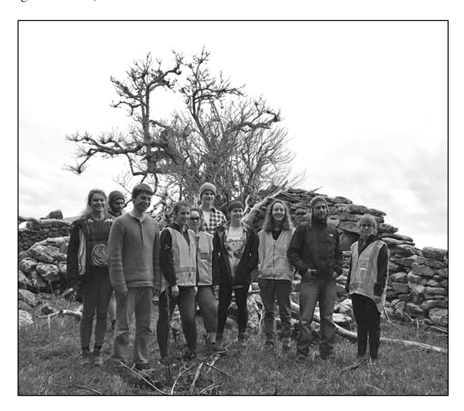
Figure 2. OUAS group at Rutherford's Farmstead on the Otago Peninsula.

is one of many similar sites in the historic Hereweka/Harbour Cone area (see Figures 2 and 3).