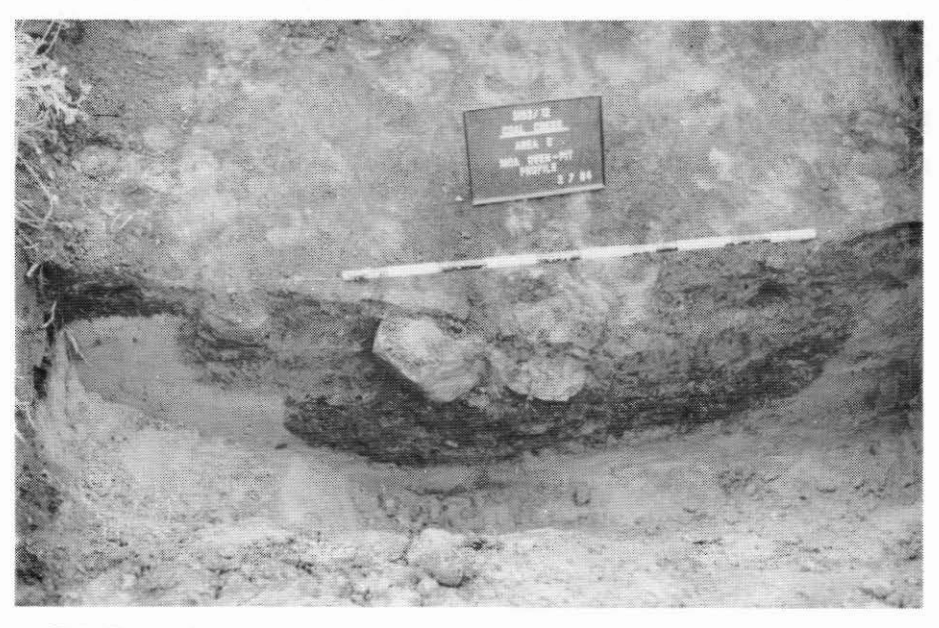
FIGURE 5. Cross-section of pit below Area E moa bone midden, Coal Creek.