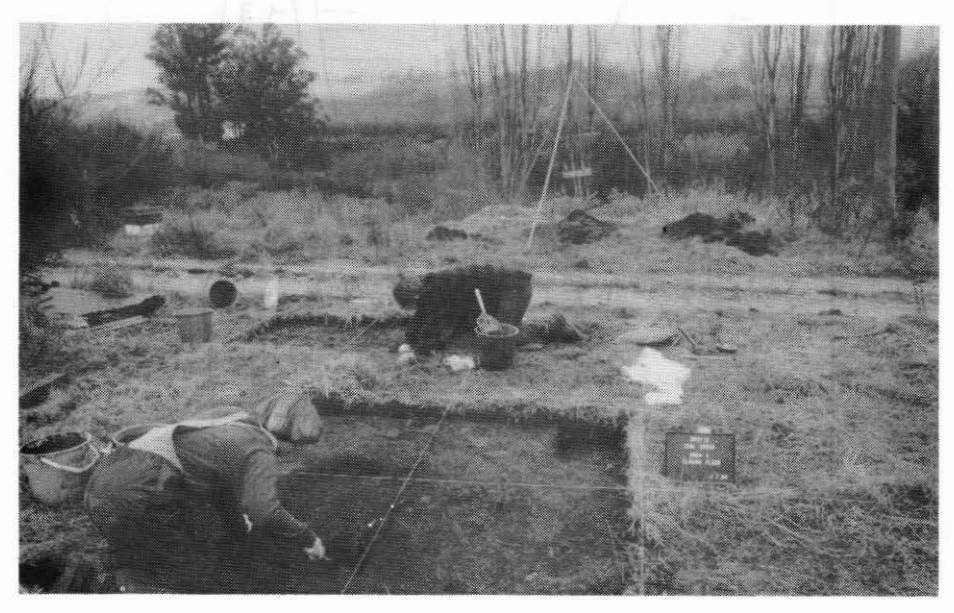
FIGURE 3. Sheridan Easdale and Andrew Piper excavating Area A.