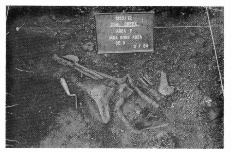
FIGURE 4. Part of moa bone midden at Coal Creek. Note lines of tracheal rings and skull at lower right.