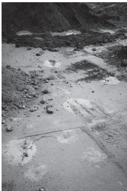
Figure 2. A view of a cluster of features, some large, some small.