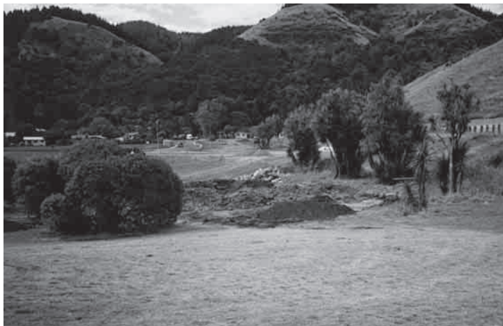
Figure 1. Setting. The photo was taken from the top of the dune looking up the valley. The area of earthmoving and the site is in the centre of the photo. Beyond is work going on for a new residential subdivision.