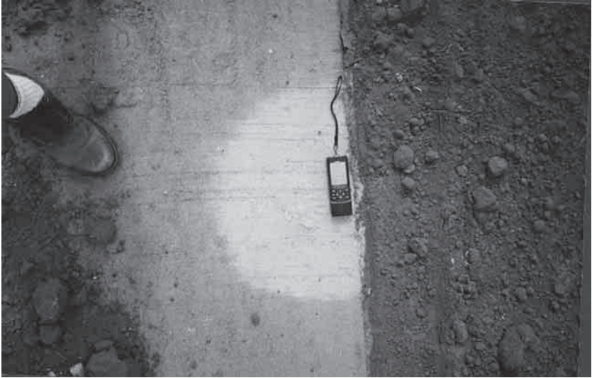
Figure 3. A view of one of the larger features, with Garmin GPS, 145 x 50 mm, as scale.