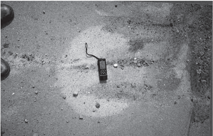
Figure 4. A view of another of the larger features, with Garmin GPS, 145 x 50 mm, as scale.