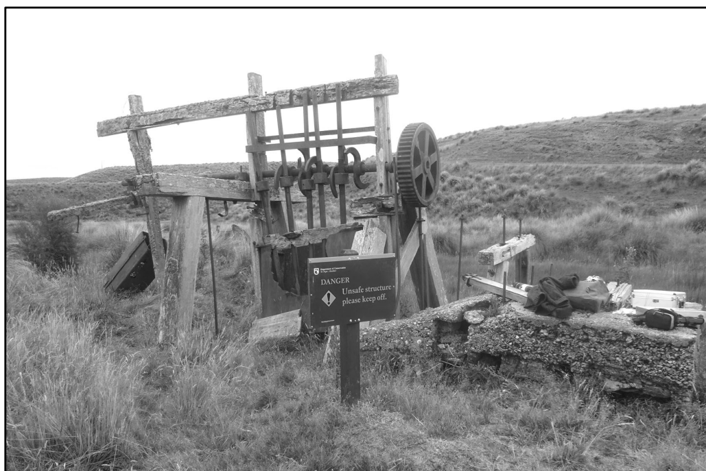
Figure 2. The Canton Battery in 2016 (Hannah Arnhold).

In 1897 the claim, along with the Otago Pioneer Quartz (OPQ) claim, was acquired by the New Zealand Minerals Company (AJHR 1896 C3A: 19; 1897 C3A: 20; Galvin 1906: 164) before both were transferred to the O.P.Q. (Waipori) Gold-mines (Limited) (AJHR 1900 C3: 24). Ten years later the Canton claim was pegged out by Pearsall and others (AJHR 1908 C3: 34) with the mine re-opened in 1910 by the New Canton Gold-mining Company. The claim was sold for the final time in 1911 or 1912 to R.J. Cotton. At this time, the shaft was approximately 180 feet deep, and was being emptied by a 6 inch pump driven by a water wheel (AJHR 1912 C2: 52). The last record of the mine working is in 1912 (AJHR 1912 C2: 53; Smith 1990: 71).