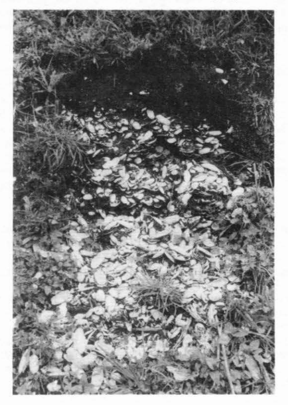
Plate 2. U14/2714: a dense concentration single species midden. Typical of the western side of the Kopurererua Stream.

The fact that the majority of sites were recorded on the western slopes of the Kopurererua stream accords with tradition, though the reasons for this preference are not apparent. The middens on the western side are also denser and generally appear in exposed sections. Of the 12 west bank midden exposures, half were of a single shellfish species (Plate 2). By comparison midden sites on the eastern bank are smaller and usually appear as scatters with a mixed matrix of shellfish species (Plate 3). Additionally all middens immediately alongside the Kopurererua are heavily disturbed, but those on the east bank far more so than those on the western bank.