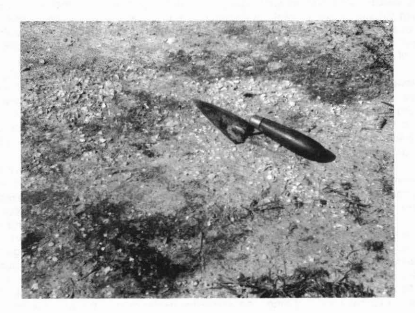
Plate 3. U14/2723: a typical Kopurererua Stream eastern bank shell scatter.

One reason for this bias in midden distribution is the urbanisation of the eastern ridge slopes along the whole length of the survey area. The alteration of the Kopurererua stream into a new canal-style channel may also account for the loss of sites on the eastern bank.