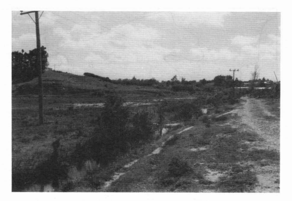
Plate 1. Judea Valley: western slopes and stream flats with farm drainage ditch. Looking north-east towards industrial zone.

and estuary, thus altering their detectable environmental context and creating problems in site interpretation. European farming practices, following drainage of the valley, will have resulted in further damage to sites by direct means such as ploughing and farm roads, as well as indirectly by the removal of protective vegetation by grazing stock.