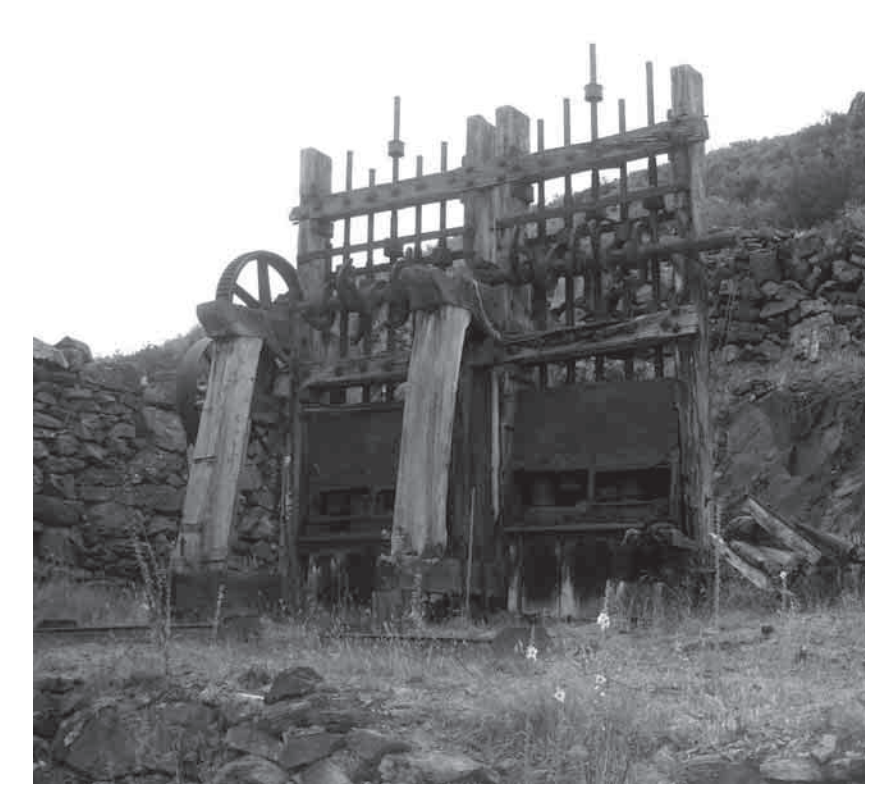
Figure 2. The battery in 2003 prior to restoration.

aerial ropeway to convey carefully selected stone to their newly-acquired battery, the old 'Come In Time' machine on the other side of the valley ( AJHR 1913 C-2: 34). They re-fitted the battery and crushed a trial quantity of Alta stone, but switched their attention to the much larger area of prospective stone in an outcrop of the Come in Time lode, on the Shepherd's Creek side of the ridge near the battery ( AJHR 1914 C-2: 49). In the 1919 report to the Mines Department, it was clear that the main focus of the new Alta group<sup>3</sup> was actually opening out the open cut area of the Come In Time claim area, crushing 100 tons of ore in the year ( AJHR 1919 C-2: 35). This open cut is easily seen from the carpark area, looking over the northern slope into Shepherd's Creek. They found little more than hopes of gold in this part of the workings, but the