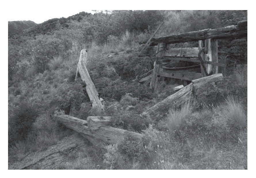
Figure 3. The winder unit at the top of the range opposite the Come in Time Battery.

top unit of their aerial ropeway which they used for the Alta workings remains near the crest of the hill opposite the Come in Time.