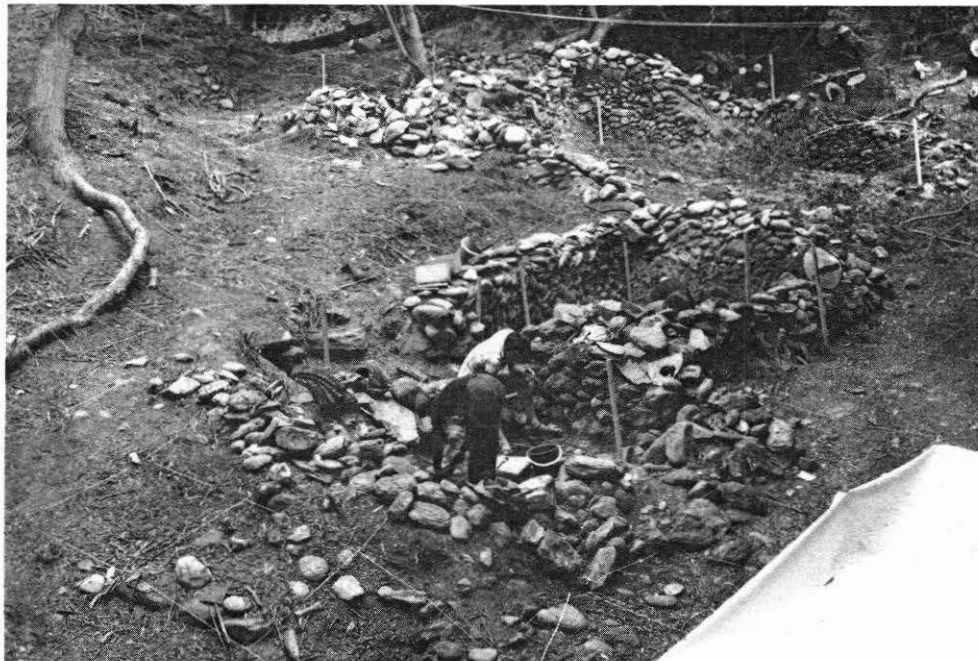
CHINATOWN EXCAVATIONS Plate 2. The remains of stone dwellings.