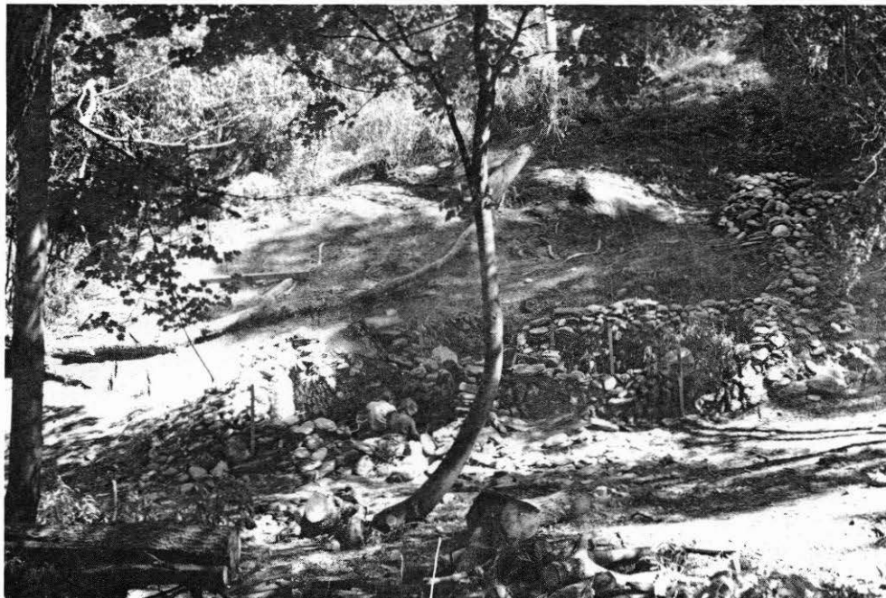
CHINATOWN EXCAVATIONS Plate 1. Excavation in progress.