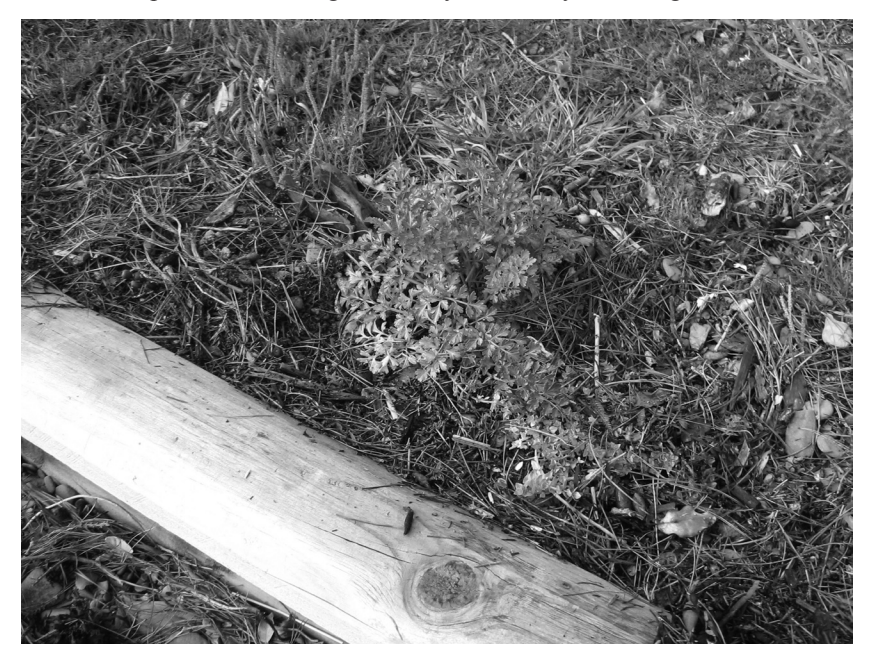
Figure 2. Scurvy grass still grows in Wharehunga Bay.

arrived at Tahiti on 18 August 1773 the sick were taken ashore each day and when the expedition sailed again six days later they were in good health.