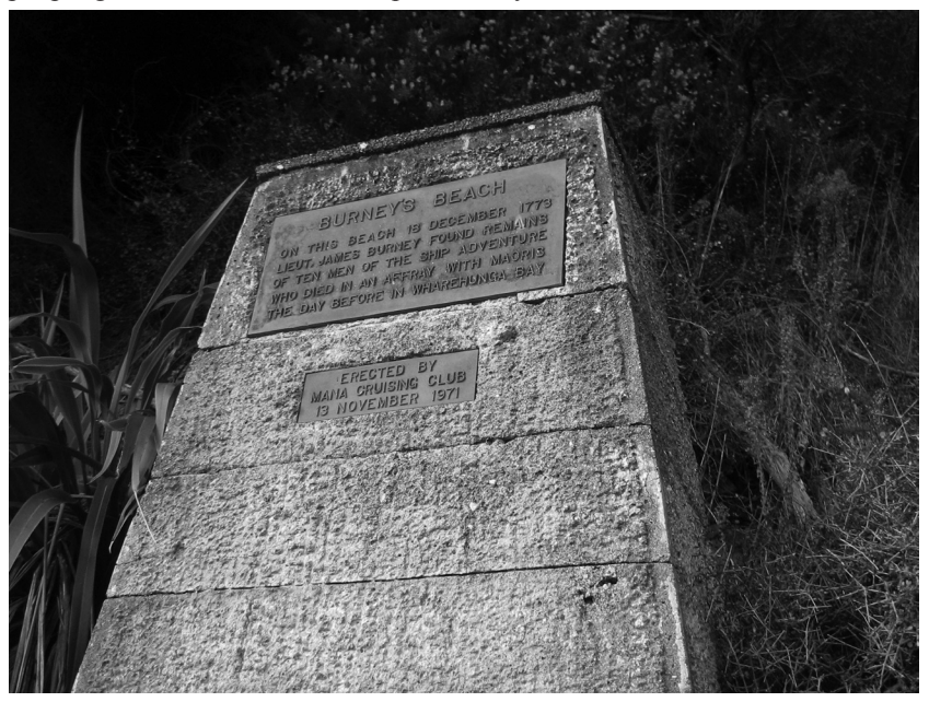
Figure 3. The Burneys Bay plaque.

preparing to attack, so they gathered up some of the body parts, including Swilley's head and Rowe's hand, and hurried back to the launch. They destroyed three of the canoes on the beach and fired one last volley at a large crowd of people gathered on the hillside up the valley.