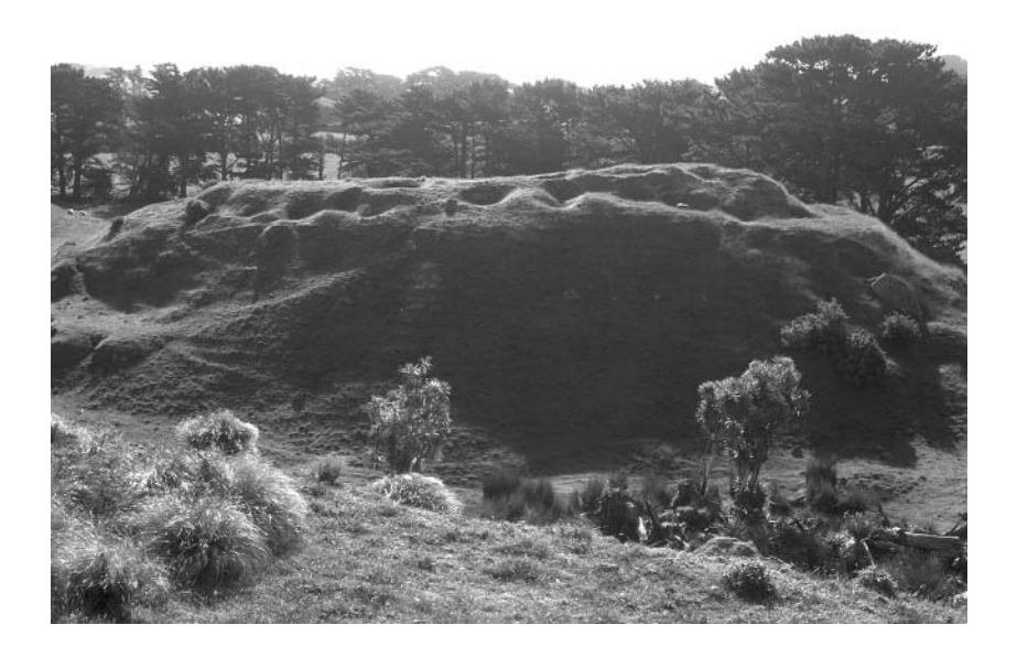
Figure 3. On Pungarehu Golf Course land this pa is protected from most forms of development damage; visited by the conference field trip, 4 December 2004.

Recent excavations at the Pohokura development site north of Waitara have revealed extensive remains which were invisible on the surface. This is an important reminder of the likelihood of unrecorded Maori sites being found anywhere in the Taranaki coastal strip. The pace of current development is such that all sites are at risk, but none more so than the vast majority, which are unrecorded and invisible on the surface.