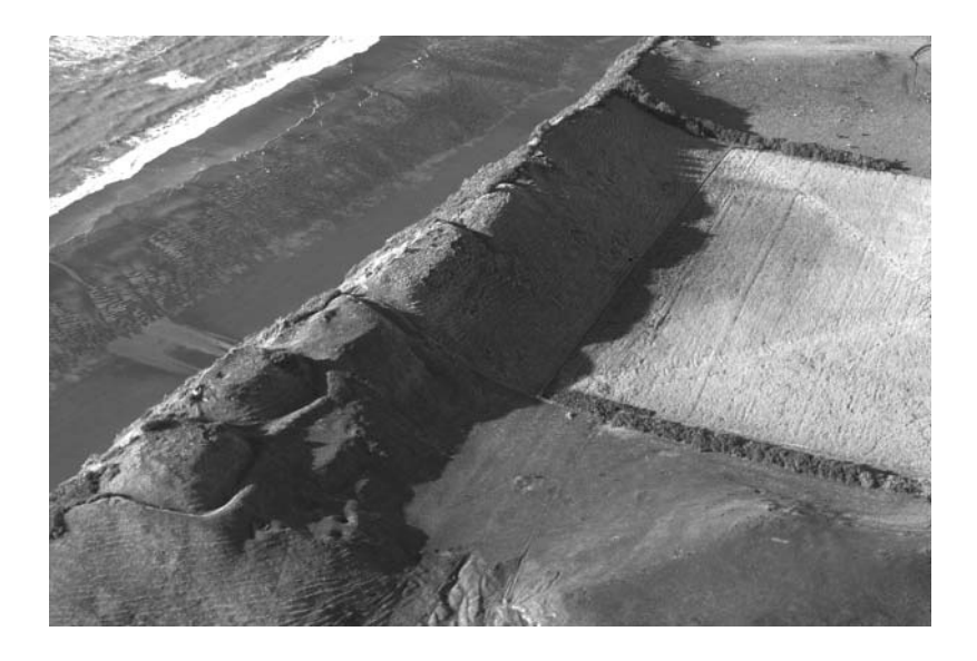
Figure 2. Ruataki pa, north Taranaki, ca 1975. Since the picture was taken half this pa has fallen into the sea from the continuing erosion of this part of the Taranaki coast.

accounts have something to say, or in rare cases where angled or zig-zag trenches indicate an early 19th gunfighter pa.