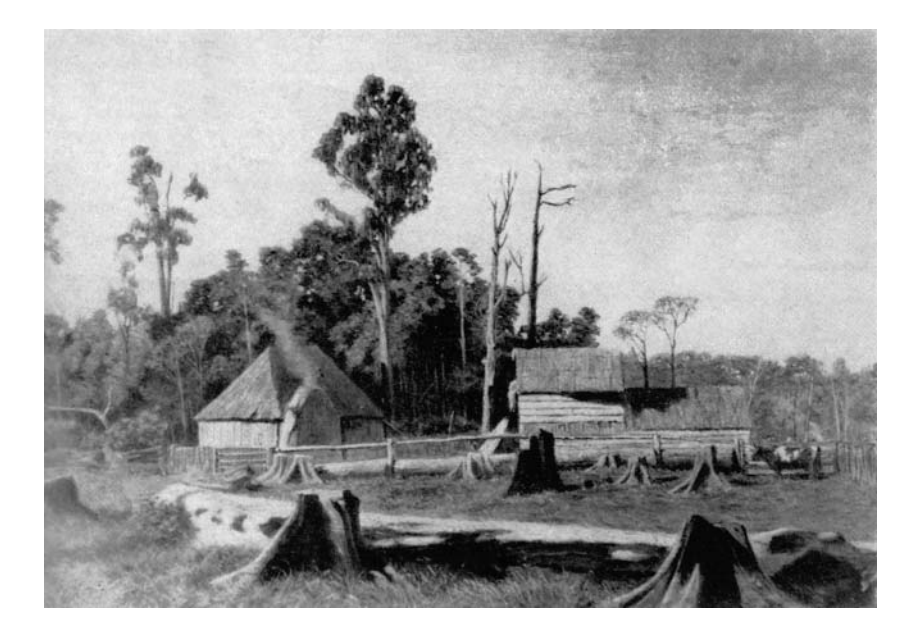
Figure 7. The Richmond homestead, Carrington Road, 1855 (Scholefield 1960 I: opp. p. 576).

The week before last when I was in New Plymouth to work on the Oropuriri (Bell Block) excavation I saw a notice advertising the auction of sections in a paddock near the old Bell Block dairy factory, to take place on December 11. On March 20 last year I searched this paddock between Mangati and Wills Roads without luck for one or two pre-1860 homestead sites shown on Carrington's map. It is very important that any such site and indeed other possible sites in this development area are not buried under the sub-division without an archaeological input.