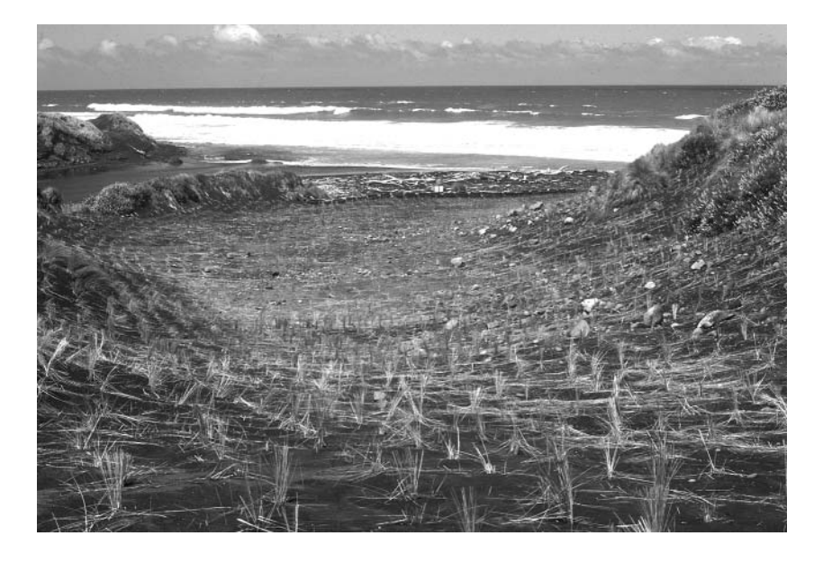
Figure 5. Kaupokonui moa-hunter site, planted in marram grass ca 1980.

We will have lost most first coastal settlement sites already to natural erosion. An average annual loss of 38 cm has been calculated for exposed parts of the Taranaki coast, so that in the 6–700 years since first settlement the sea may have advanced more than 200 m in places. What remains at Kaupokonui and Waingongoro and one or two other places in Taranaki is very important. The story of these first settlements is yet to be told.