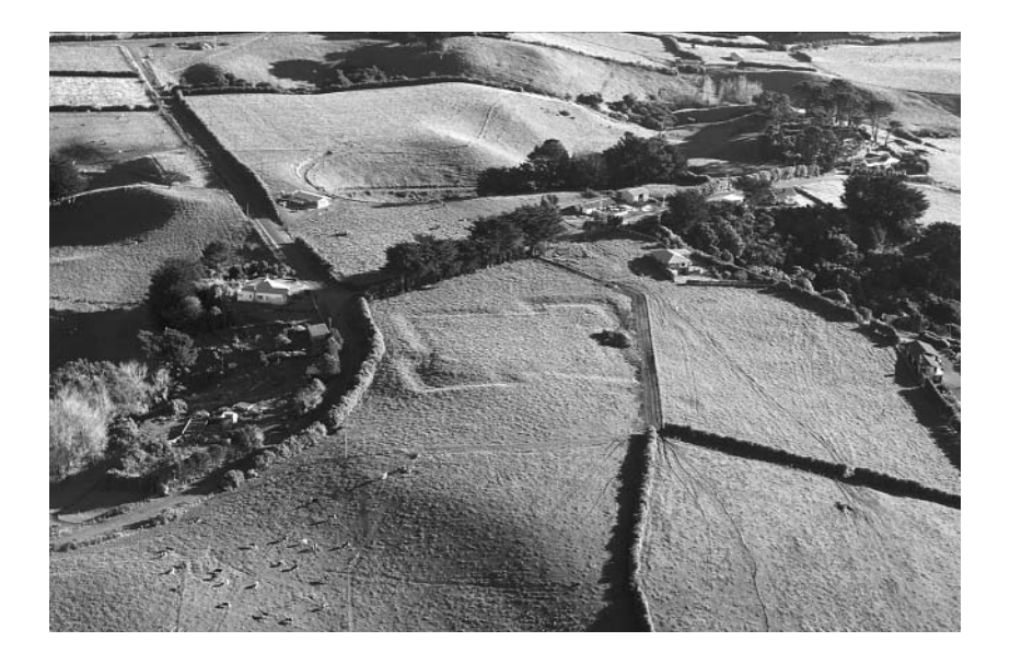
Figure 4. Waireka Camp, a 60 m square British Army redoubt in the Omata district, south of New Plymouth, dating from winter 1860; visited by the conference field trip, 4 December 2004.

At first I assumed that Pakeha fortifications recorded in a general way the progress of fighting between Maori and Pakeha. In rare cases this was true. In the Huirangi district near Waitara eight earthwork redoubts and an attacking trench or sap mark the 1861 advance of General Pratt's army against Maori pa and rifle pits above the left bank of the Waitara River. These were tactical or battlefield works.