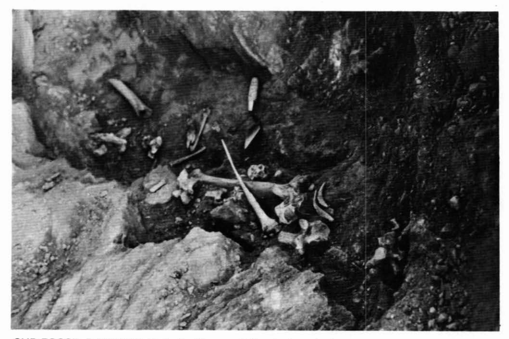
SUB-FOSSIL DEPOSITS Plate 1. Firewood Creek deposit during excavation.