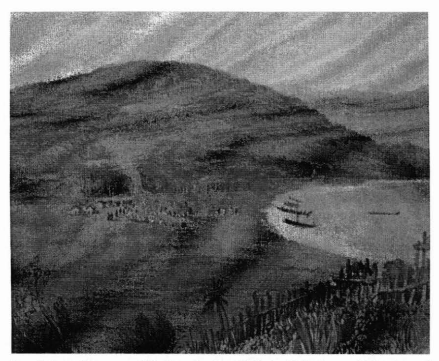
Detail from Paremata Whaling Station 1843 by S.C. Brees. Collection of Pataka Porirua Museum of Arts and Cultures. In this work Taupo Village is depicted without palisades. Like Angas's image the Village is shown at the southern end of South Beach.

Aside from the house construction and the above mentioned pipe laying there has been no record of substantial earthworks having being carried out. It therefore seemed likely that those areas of the section untouched by the aforementioned work would retain features from the pa. This likelihood would be increased given the size of the palisading associated with the pa and the semi-subterranean nature of at least some of the structures. The nature of the structures that formed the site are such that remnants of them were thought to probably remain in sub-surface deposits. However, given that there has been a large amount of activity since the 1920s on the site it is highly likely that the deposits would be disturbed and perhaps found only in isolated pockets. In fact during the demolition absolutely no material earlier than the 1920s was found – pure sand dune without even a trace of archaeological material was found. On