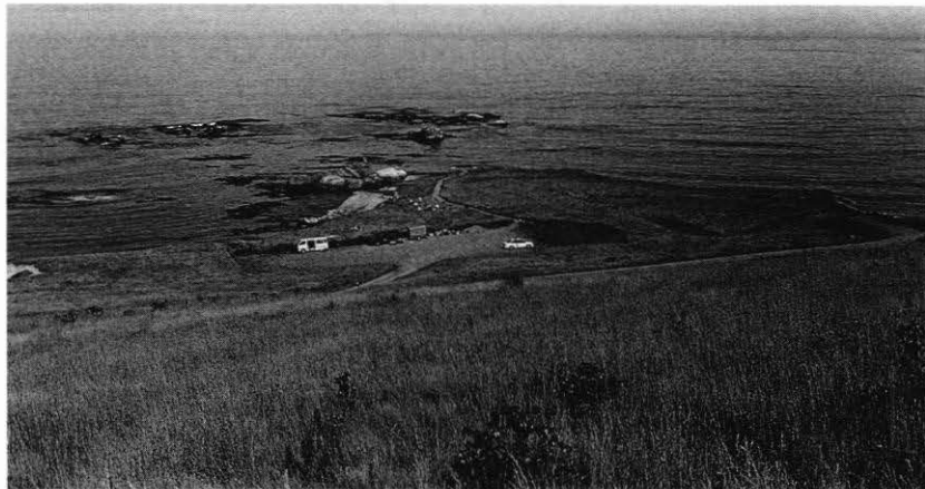
Figure 1. Shag Point and environs looking west. The recently bulldozed car park is in centre frame.