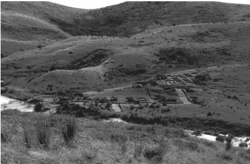
Figure 30. Sarah's Gully, open settlement excavation, 1959.