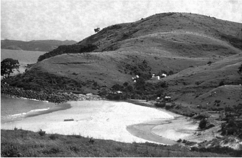
Figure 29. Sarah's Gully, pa, archaeologist's camp below and beach and terrace, 1959.